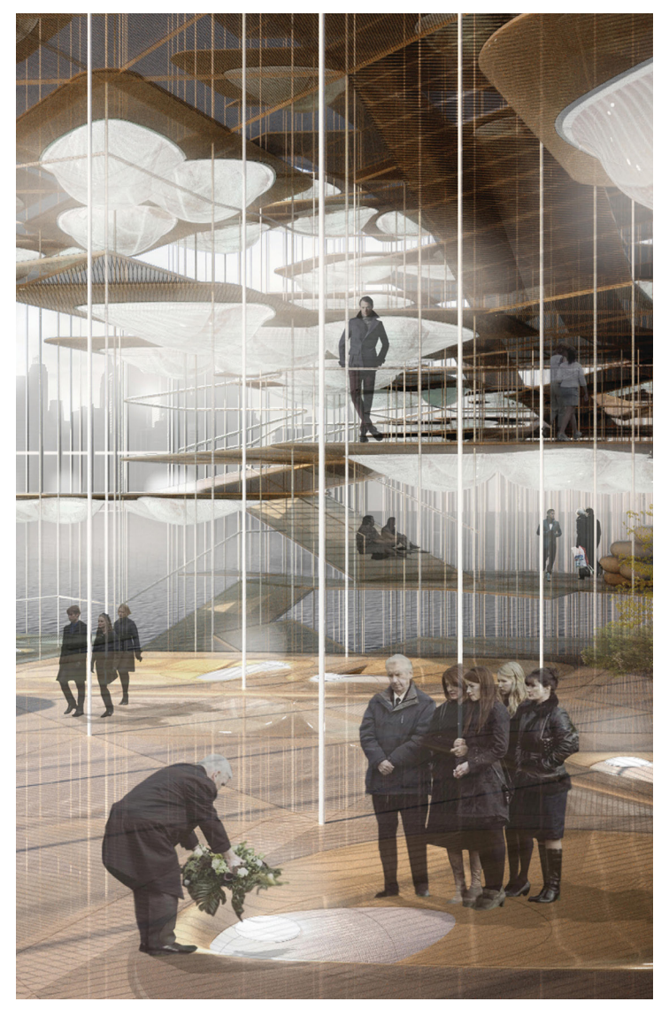
October 6 - November 4, 2018