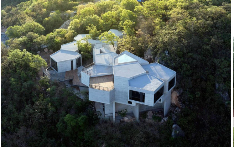
Bilbao | Ventura House

Following a series of background lectures, office visits, research, and transformative exercises on the formal and political context of the building, we will travel to Mexico City the first week of October to tour the building along with a number of other project and practices engaging in these exchanges of inside and outside, public and private: the conjoined house/studios of Frida Kahlo and Diego Rivera, the constructed domestic landscapes of Luis Barragán, of the modernist campus of UNAM (with its own provocative of exchanges between ornament and tectonics), the porous spatiality of the Museum of Anthropology, the early administrative complex of the pre-Columbian city of Teotihuacan, and visits to contemporary works and offices like GSAPP's own Tatiana Bilbao.