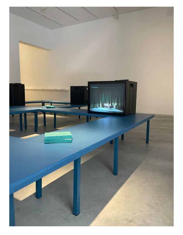
Cuentos de cuentas, installation view