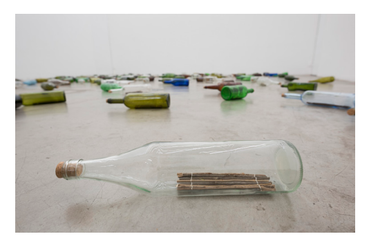
The Sea You See Will Never Be the Sea I've Seen, detail view

This installation features approximately 200 glass bottles, each containing a raft. These bottles represent the experience of distance and displacement inherent in migrations: the possibility of living in between cultures and languages, and the complex feeling of belonging and/or being an outsider.