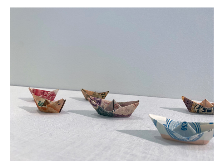
Fleeting Fleet, installation view

Fleeting Fleet is a collection of banknotes from different countries in Latin America that lost their value and were removed from circulation, meaning they no longer have any monetary worth and are now nothing more than pieces of paper.