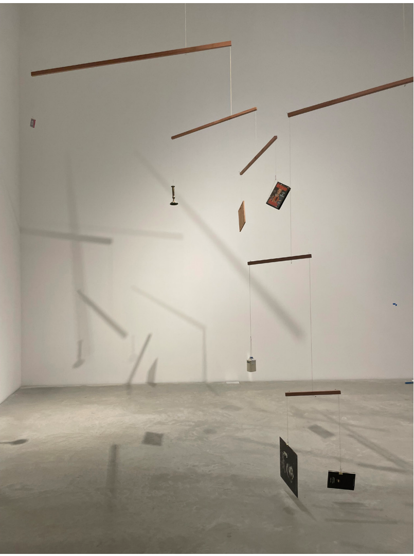
La Plata y el plomo (Cash and Lead), installation view