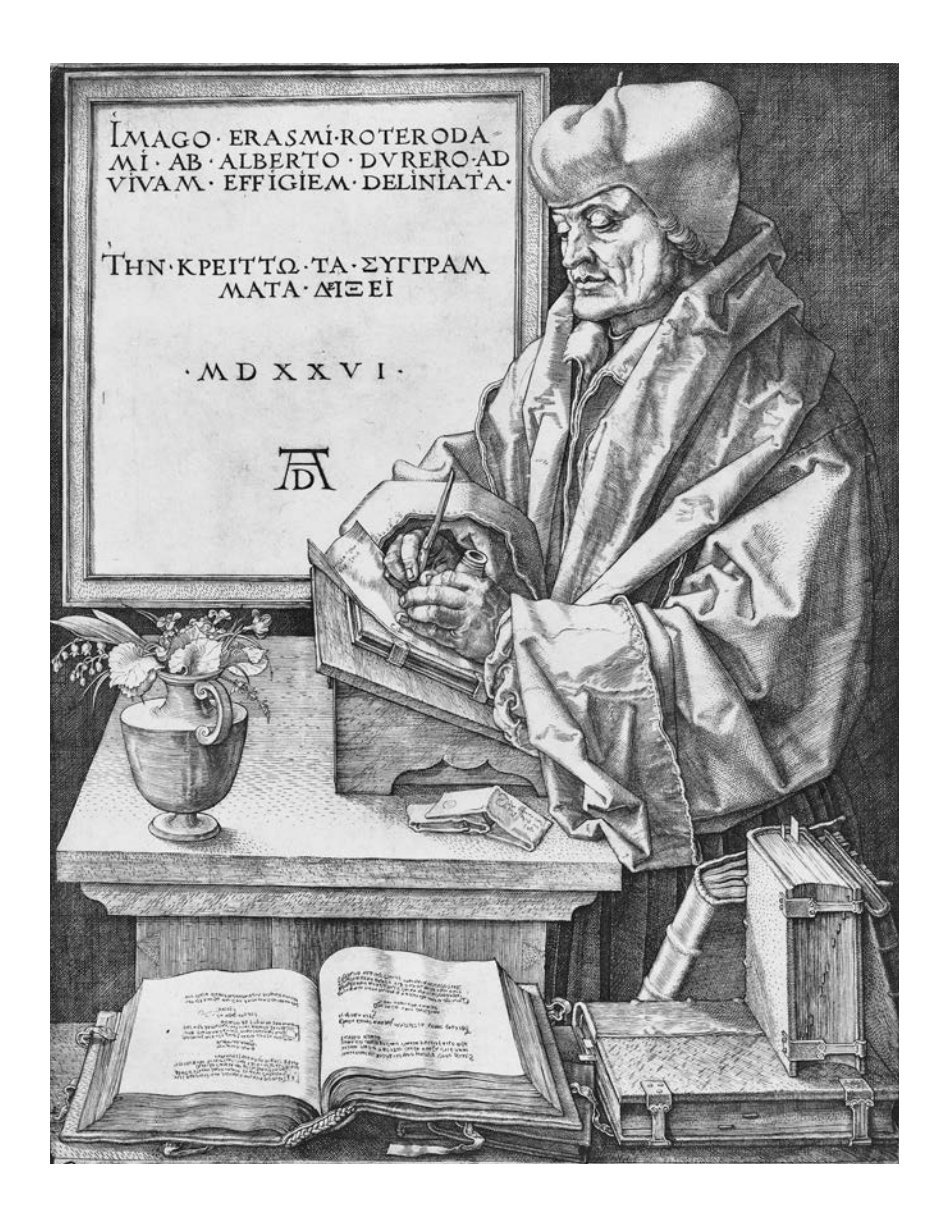
Figure 1.5. Albrecht Dürer, Erasmus of Rotterdam , dated 1526, engraving, 25 x 18 cm, (Washington, D.C., National Gallery of Art, Rosenwald Collection).