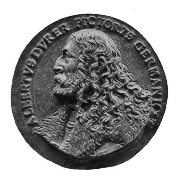
Figure I.1. Hans Schwarz, portrait medallion of Albrecht Dürer, 1519–20, bronze, 5.6 cm dia. (Hannover, Kestner-Museum).