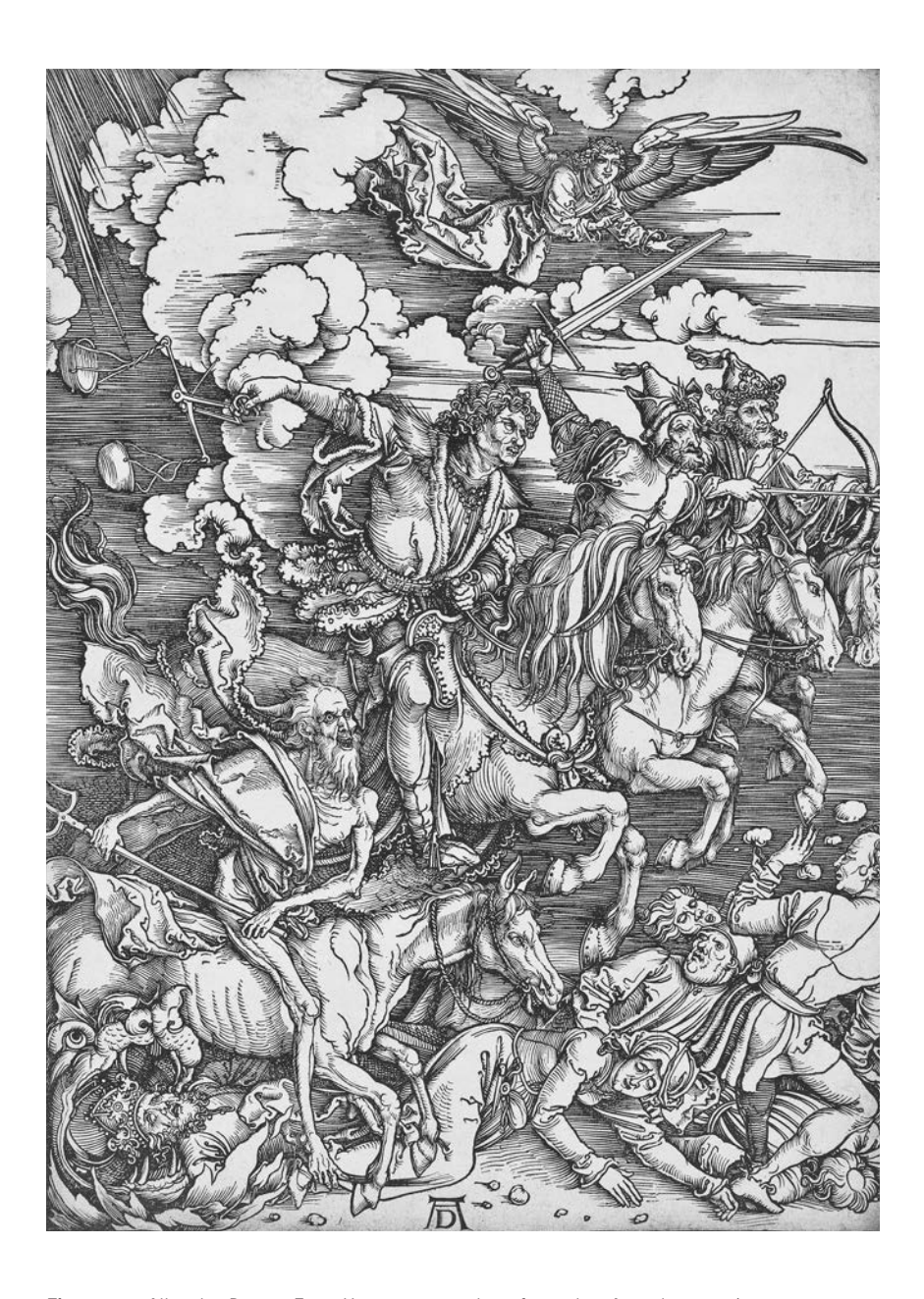
Figure 1.3. Albrecht Dürer, Four Horsemen , woodcut from the Apocalypse series, ca. 1496-98, 45.7 x 31.5 cm (Washington, D.C., National Gallery of Art, Ferdinand Lammot Belin Fund and William Nelson Cromwell Fund).