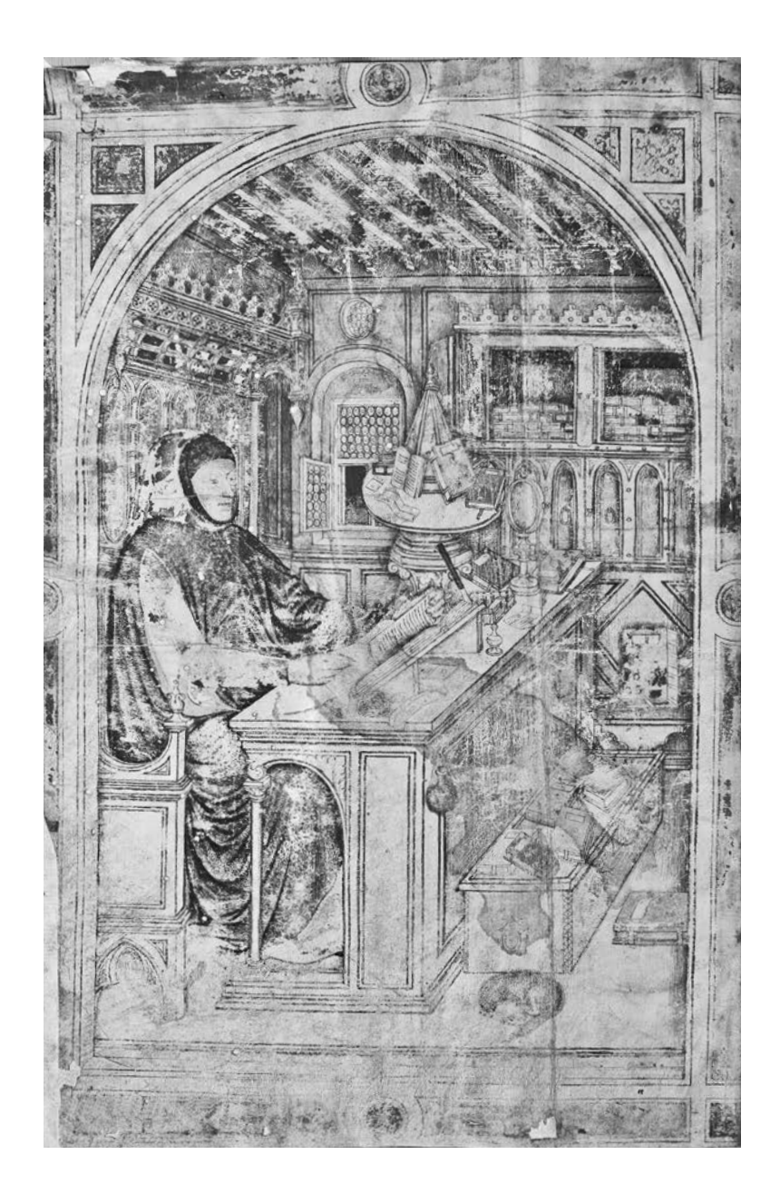
Figure I.4. Portrait of Petrarch in his studio, from Francesco Petrarca, De viris illustribis , ca. 1400 (Darmstadt, Hessische Landes- und Hochschulbibliothek, Hs. 101, fol. 1v).