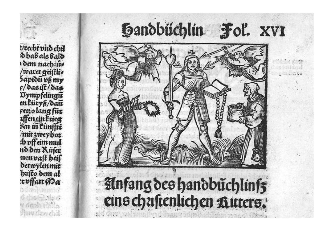
Figure 1.6. Urs Graf, The Christian Soldier between Virtue and Sin, woodcut for Desiderius Erasmus, Enchiridion, oder Handbüchleins eins christlichen und ritterlichen Lebens... (Basel: Adam Petri, 1520), fol. xvi.