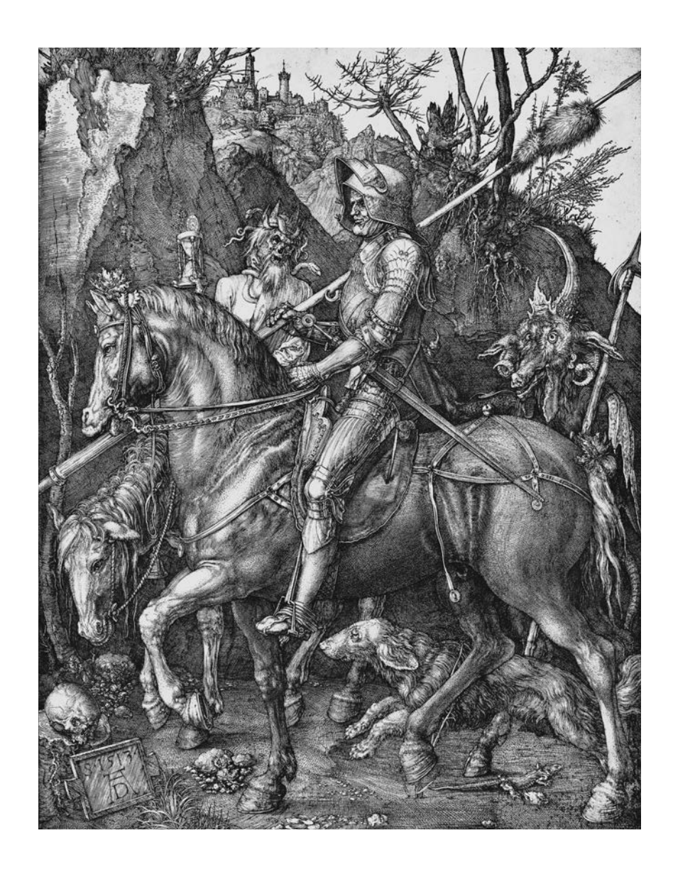
Figure 1.7. Albrecht Dürer, Knight, Death, and the Devil , 1513, engraving on laid paper, 24.8 x 19 cm sheet (trimmed to plate mark) (Washington, D.C., National Gallery of Art. Gift of W. G. Russell Allen).