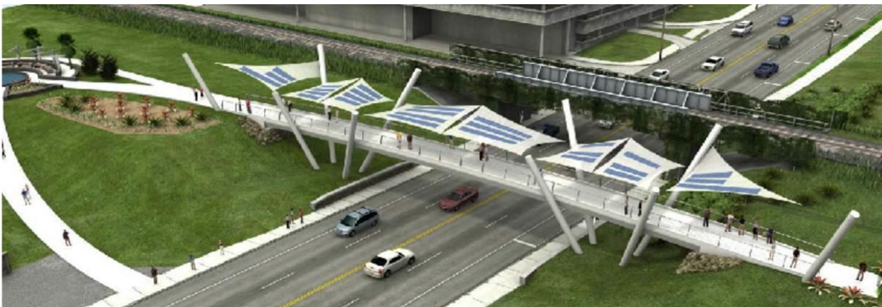
Capital Cascades Bridge, Tallahassee, FL. designed by Figg Bridge Group. Photovoltaic membrane design, engineering, testing and fabrication, by Pvilion.