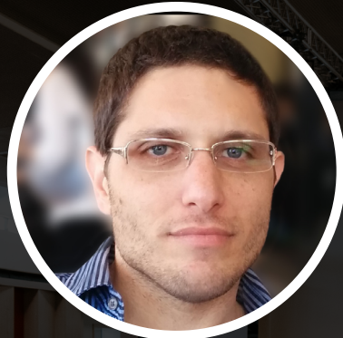
On Yavin Syndika