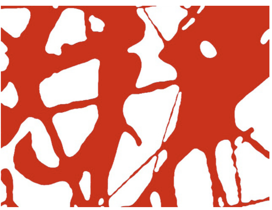
Daan van Golden, 2006, Study Pollock, 195x140 cm