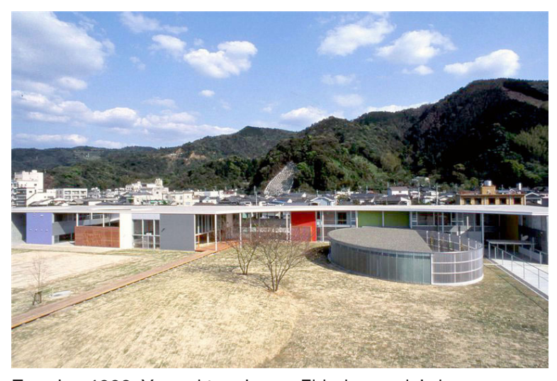
Toyo Ito, 1992, Yatsushiro, Japan, Elderly people's home