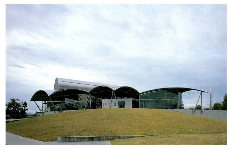
Toyo Ito, 1988, Kumamoto, Japan, Yatsushiro Municipal Museum