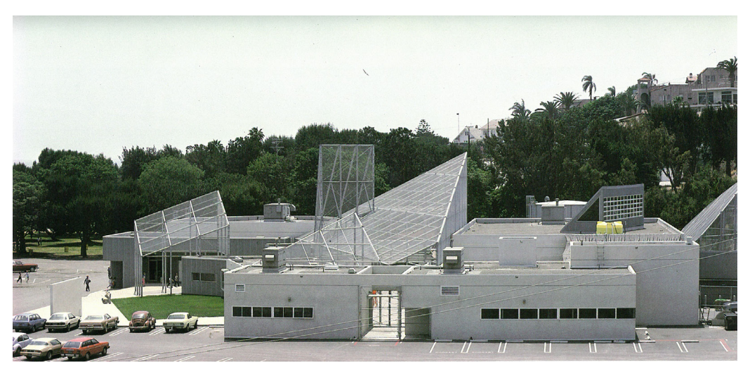
Frank Gehry, 1979, San Pedro, California, Cabrillo Marine Museum