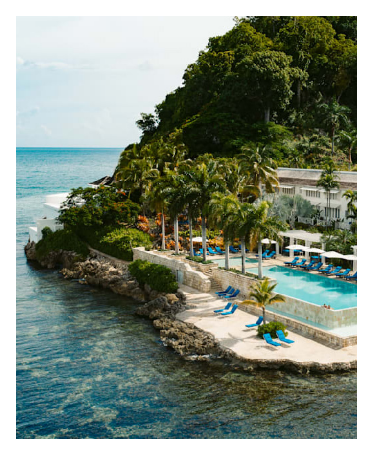
Figure 2: Montego Bay, Jamaica

these photographs are usually cruise ships, resorts, or hotels and are not likely to include any existing homes or rural areas of the island. The use of staged photos and manipulation of certain elements, like directing lines and particular angles, help sell an idea of a tropical experience. As onlookers and consumers, we often blindly trust what we are shown, especially when we do not have prior knowledge of the topic being portrayed to support or refute its representation. We heavily rely on imagery to inform us about places we have never been, especially with the increased use of social media platforms with primary content in the form of photos and videos and influencers with large followings.