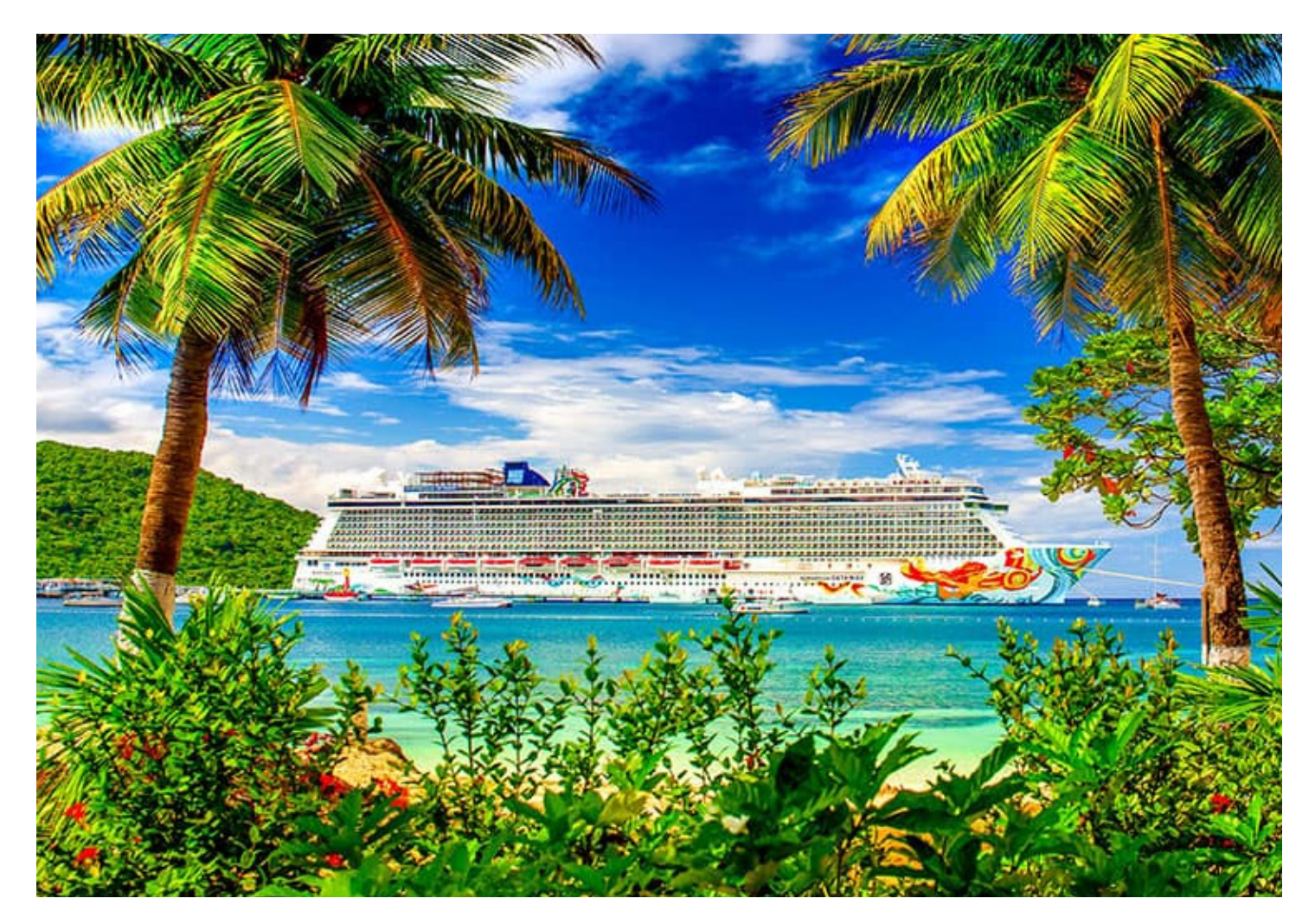
Figure 3: Caribbean Cruise.

draws you in like "last minute deals" and various travel packages. "All-Inclusive" is heavily marketed in tropical locations to promote a very isolated travel experience that most tourists prefer or think is the correct way to visit a place like the Caribbean.