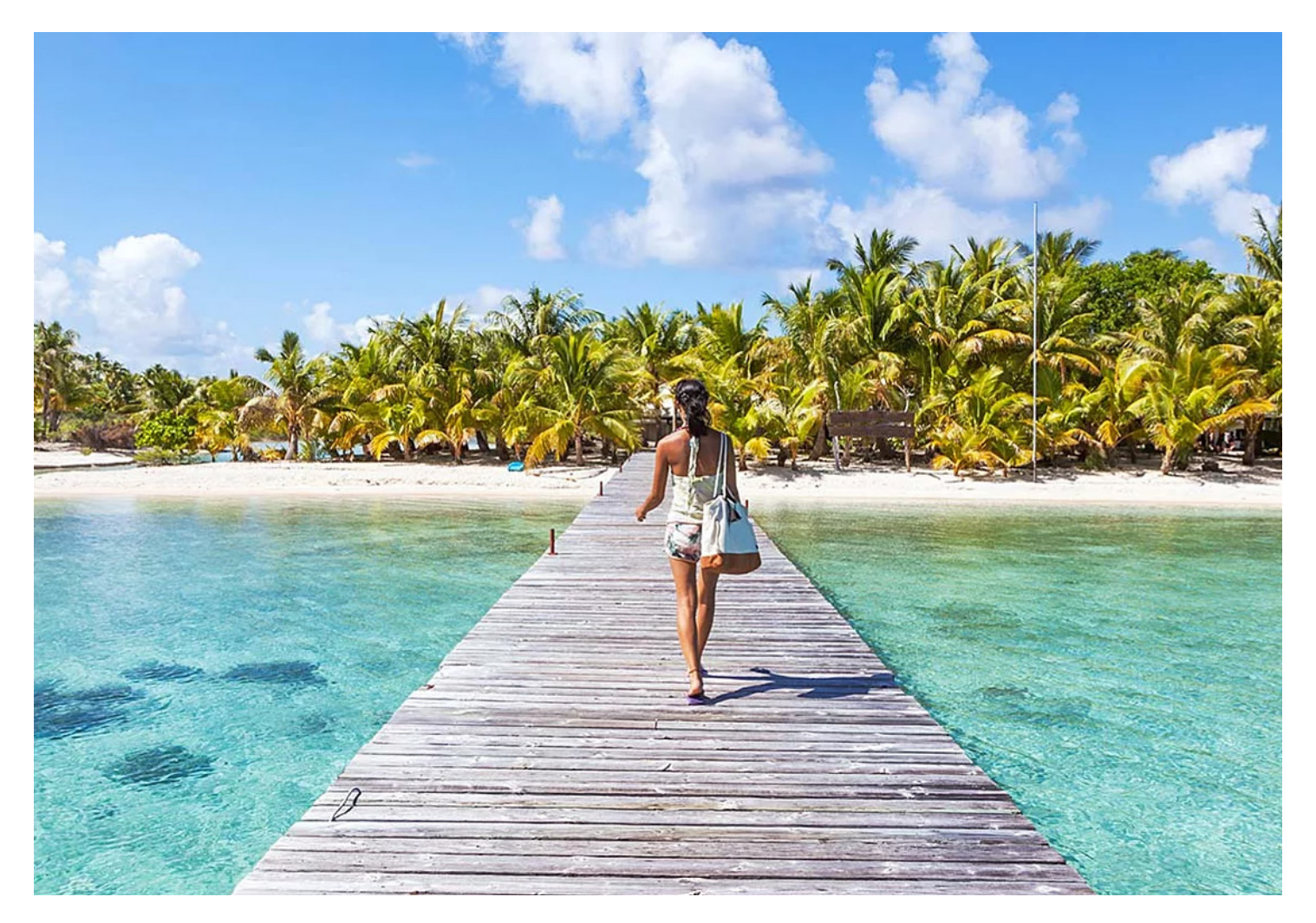
Figure 5: "Instagram-Worthy" Photo. Specific location unknown.