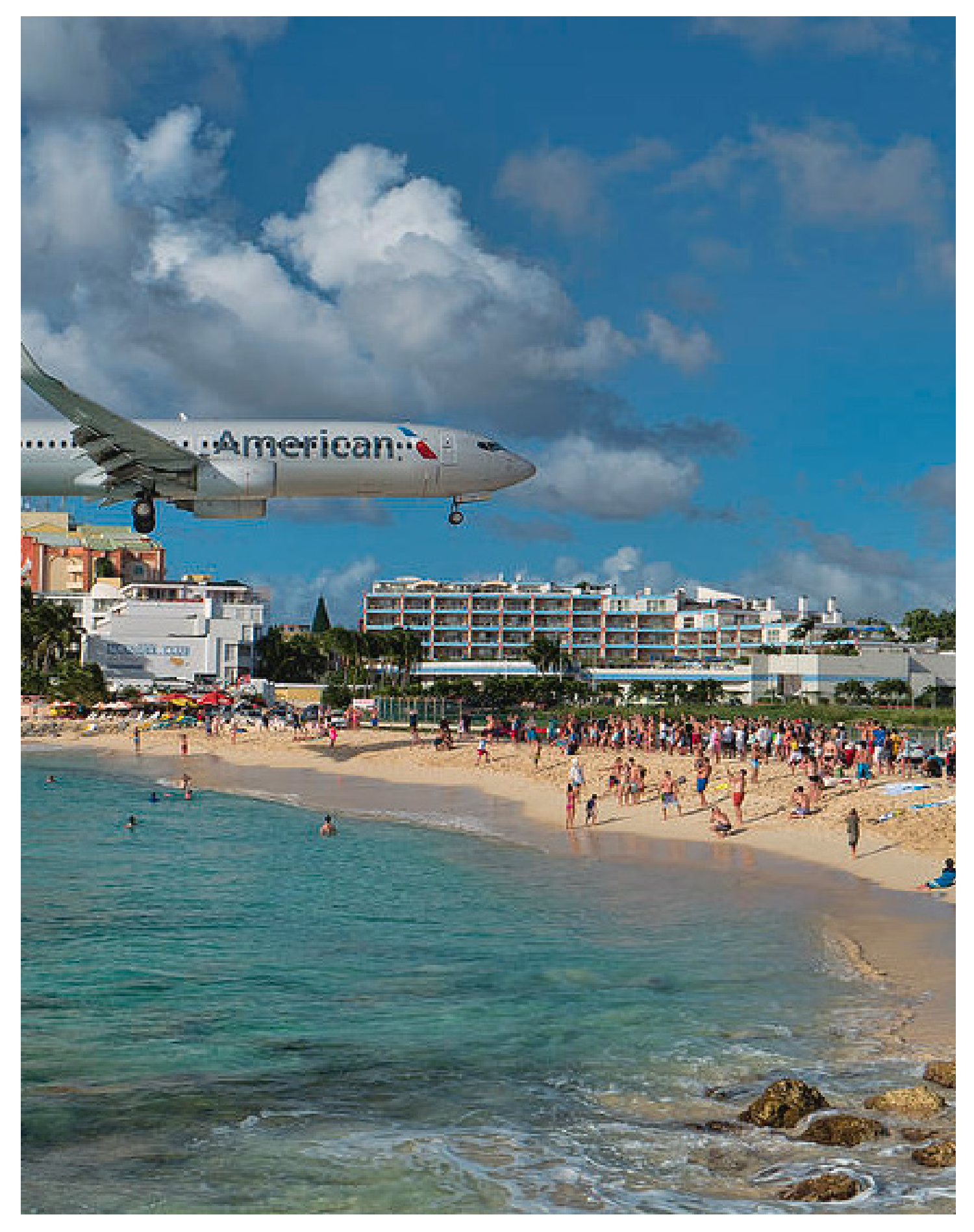
Figure 4: Airplane approaching St Maarten.