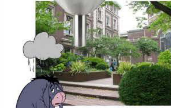
"The nice thing about rain," said Eeyore, "is that it stops." "Eventually."