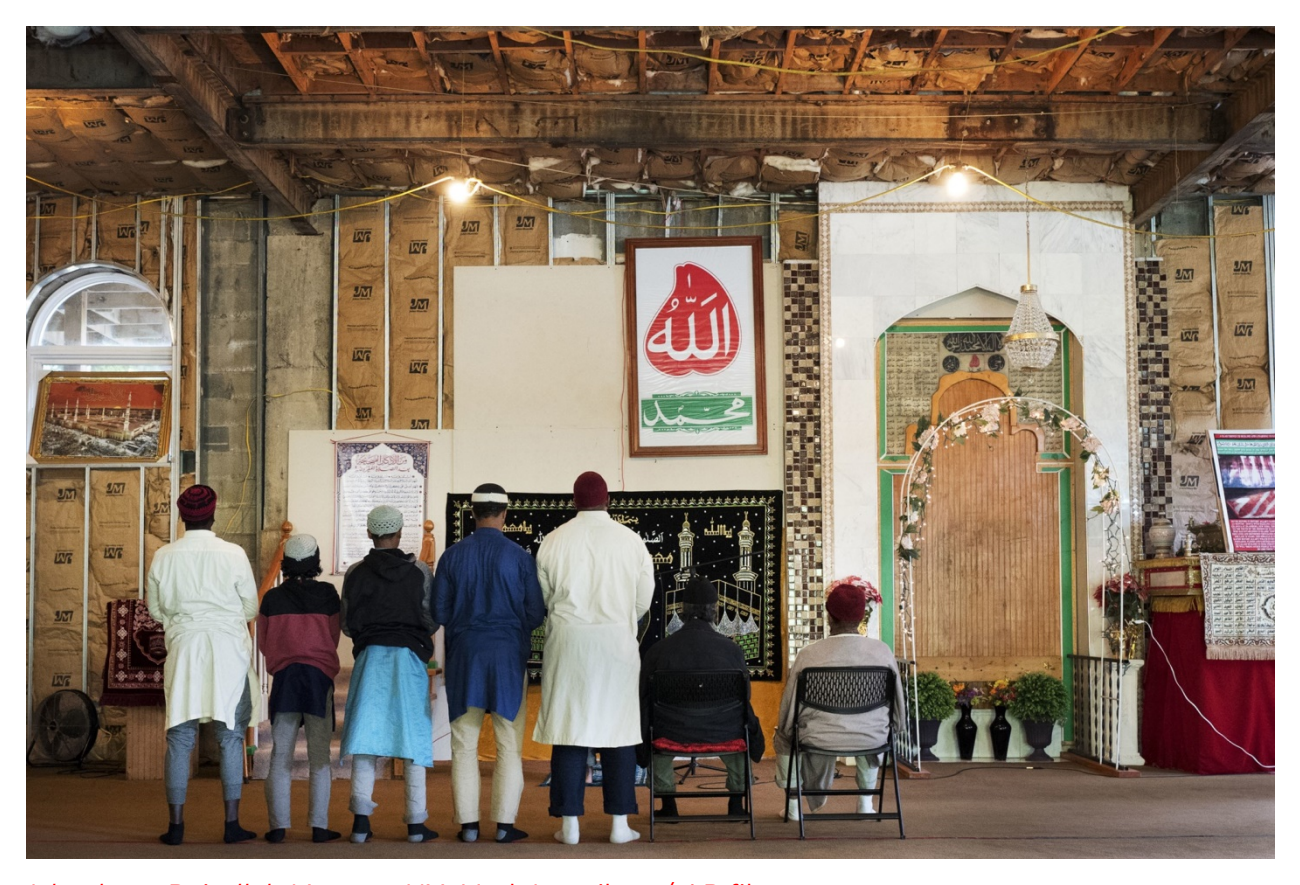
Islamberg Baitullah Mosque, NY.