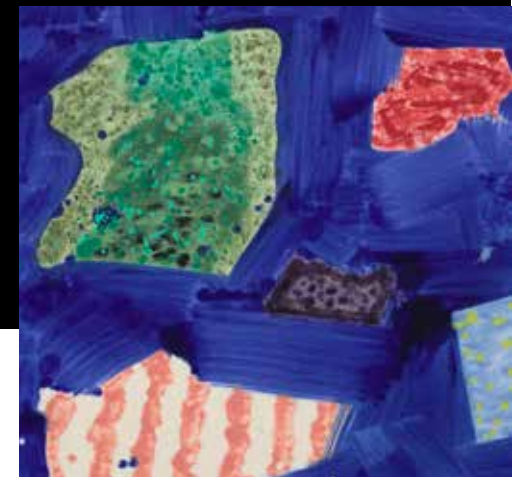
Untitled (#10-20) , 2020, (detail)

Virtual ICA LA allows you to virtually visit our space and navigate through Rebecca Morris: 2001-2022 and other exhibitions using your computer or smart phone. theicala.org/en/digital-projects