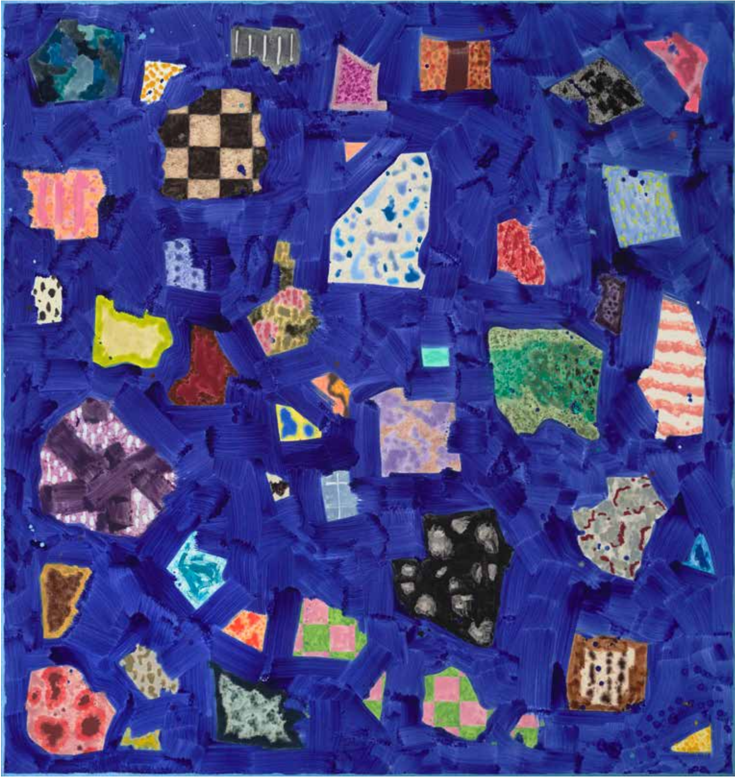
Rebecca Morris, Untitled (110-20) , 2020. Oil on canvas, 90 x 95 in. (228.6 x 241.3 cm).

HOW WOULD YOU DESCRIBE THIS PAINTING'S ENERGY?