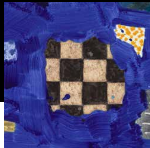
Untitled (#10-20) , 2020, (detail)