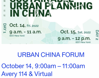
URBAN CHINA FORUM

Organized by the UP PhD Students as part of the Lectures in Planning series.