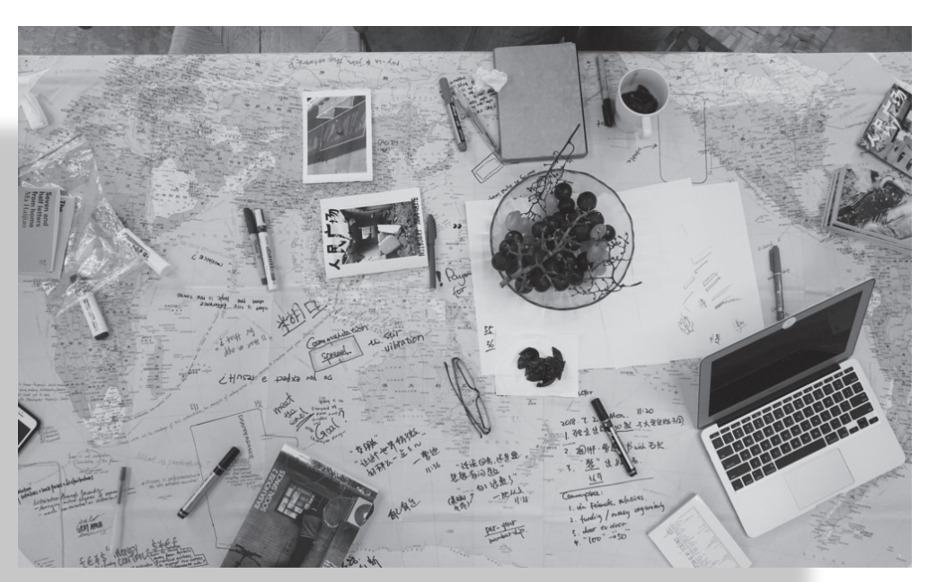
Mapping at the first DAE meeting at the Institute for Provocation in Beijing, 2018.

And now with the virus spilling over, the acceleration that has made a deep impact on human bodies is made manifest, also on every living organism we have brought into our activities in one way or another (exploitative, most of the time). Tourism also accelerates the pandemic, and it is, of course, one of the industries severely affected. While the reinforcement of borders becomes even more apparent, and the term "Southeast Asia" cannot be more fictional than here and now. We are controlled by the territories of country, city, and home, and transnational relationships are temporarily suspended. For example, the Singaporean government warns their citizens to avoid travelling to Thailand, and Chinese tourists are not welcome to eat in certain restaurants in Chiang Mai, the north of Thailand. Like other forms of public gathering, the national book festival was cancelled to avoid the risk of having people physically in touch (also, the term "in touch" becomes very physical, not metaphorical like it used to be). Now, the virus is a reminder of chronic problems that have never been resolved—say xenophobia, economic injustice, social segregation, and so on.