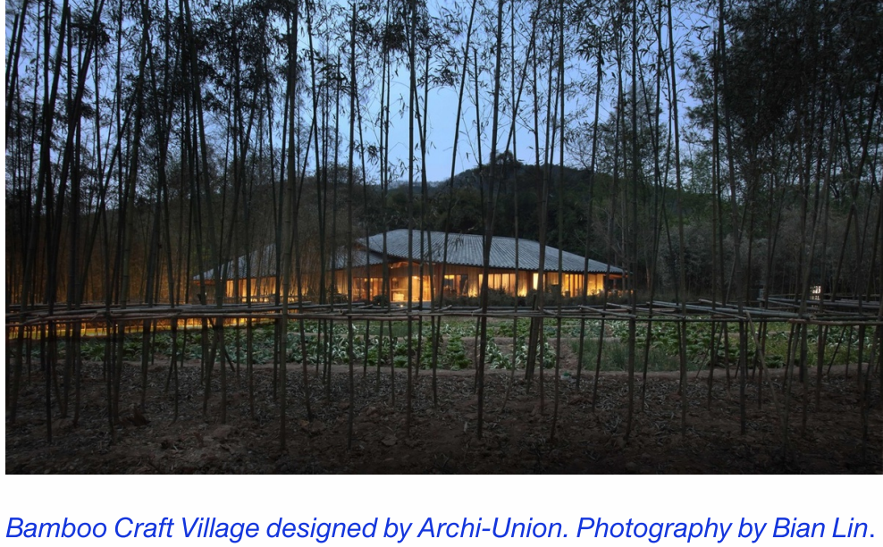
Bamboo Craft Village designed by Archi-Union.