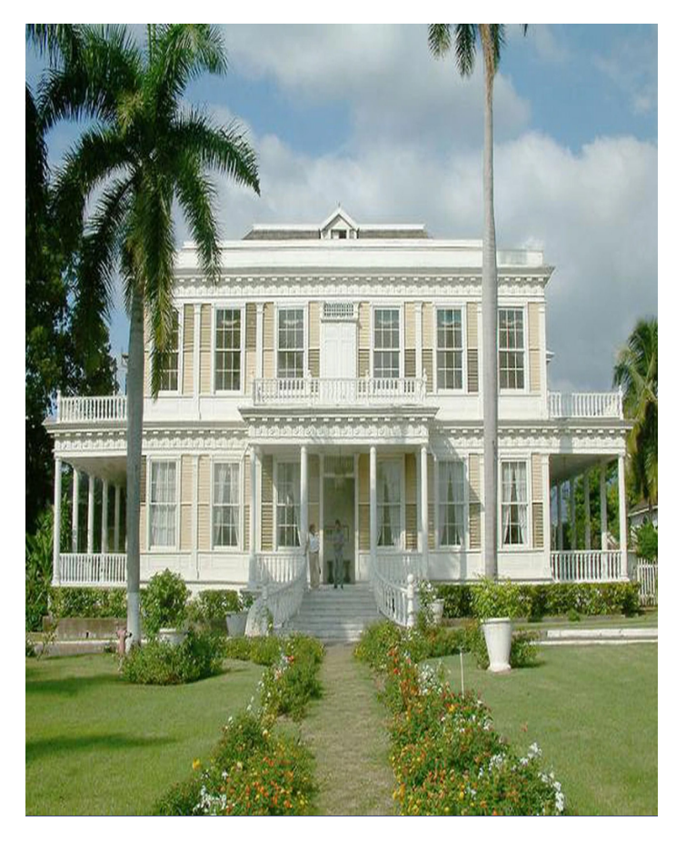
Arslanian, S. (2014, June 10). Exploring Jamaican architecture: Colonial, tropical and contemporary. Culture Trip. Retrieved December 14, 2021, from https://theculturetrip.com/caribbean/jamaica/articles/exploring-jamaican-architecture-colonial-tropical-and-contemporary/