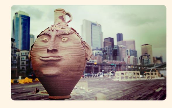
High Production Value

Typically attended by a diverse audience of industry leaders, including influencers and stylists. For 18 yrs FAT has been a leader in fostering diversity.