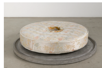
Untitled, 2019 Mattress, onyx fountain drain, fence, plaster 12 × 54 × 54 in. (30.5 × 137.2 × 137.2 cm)