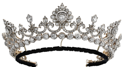
ABOVE LEFT: The Anglesey Tiara, c.1890, a Victorian tiara/necklace, formed of a graduated row of old European and old mine cut diamonds which detach to form a rivière necklace.