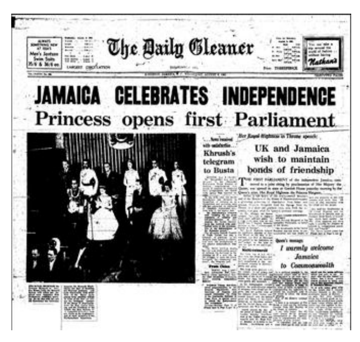
Figure 2: Photo depicting the first newsprint on the independence of Jamaica on 1962.

Jamaica was under the rule of English colony until 1962 which is the moment the Jamaican Constitution which was the very first legal document that provided freedom, rights and privileges to the citizens of Jamaica. The Constitution reflects the country's independence as a nations state and to this very day, remainst the foundation to the island's legal systems and institutions.