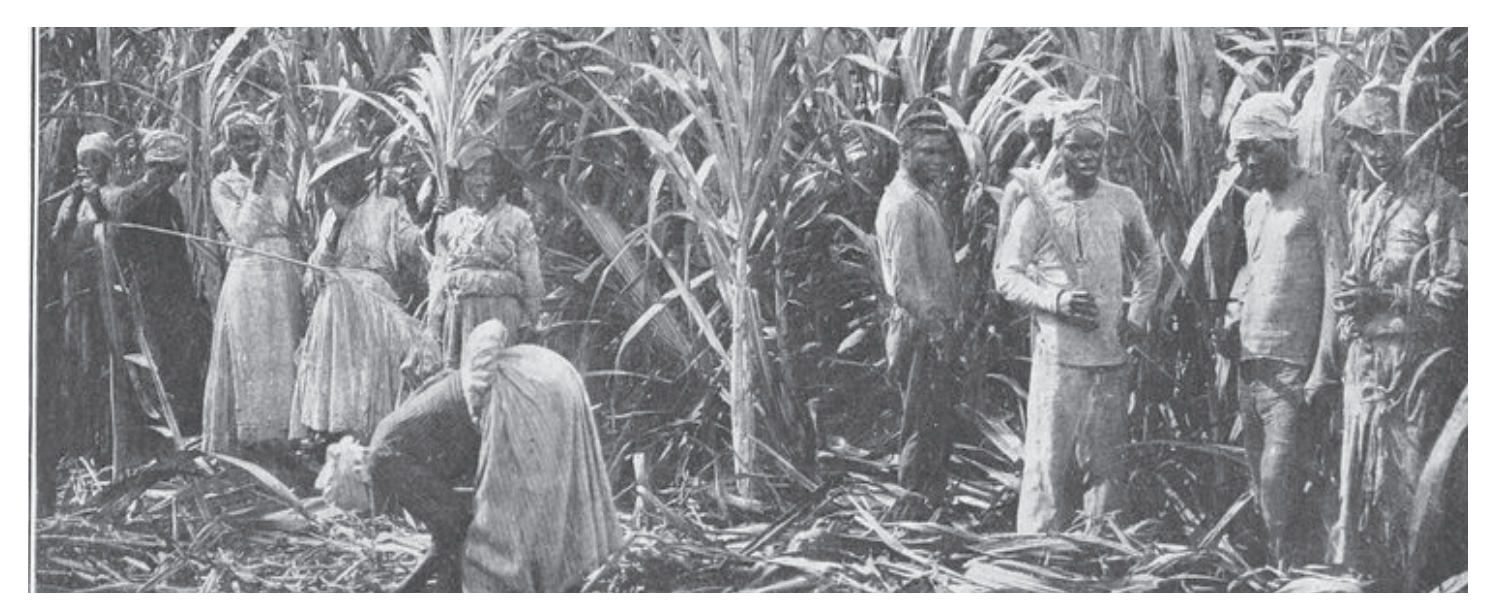
Figure 1: Photo depicting workers from 1872 in a colonial plantation in Jamaica