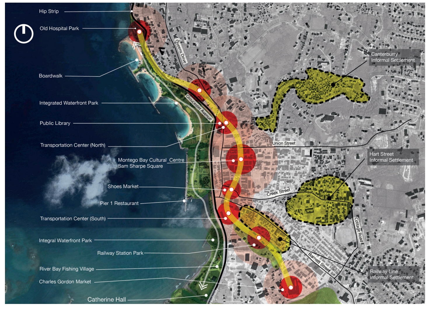
Figure 5: Urban proposal illustrating the plans for a new integrated waterfront park

The strategic boardwalk design is to induce more connections and to increase the duration of the users of the infrastructure. The main purpose of the design is to solve the issue of lack of beach that are free to access and use by the local residents as most areas of the beaches are owned by individual private hotels. The introduction of this boardwalk would also create green spaces for the residents. Furthermoree, the infrastructure is planned to be constructed with multiple transports hubs adjacent to it at different points to promote easy access for the locals travelling to the place. This proposal is crucial as the segregation between the tourists and locals have left the lives of the locals at stake and the introduction of the park will effectively allow for a public space for both which in turn will push for a gradual integration between the local and tourists that will eventually benefit the tourism economy in long term.