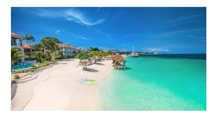
Figure 3: Photo depicting a hotel resort situated in Montego Bay tourist region

For Jamaica, as well as other Caribbean Islands, Tourism was one of the brightest spots of the economy in the late 20th century other than bauxite output which was deemed to be a declining economy with non sustainable tactic. Jamaica's appeal to tourists derived from its natural scenic beauties, warm climate and white and sandy beaches as well as the welcomenss of the local residents. The island's proximity of the North American tourist