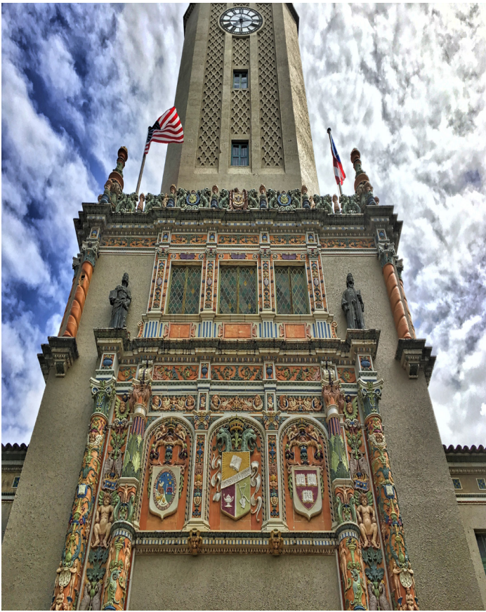
Figure 2: New University of Puerto Rico (Wikipedia 2021).

style is influenced by Spanish culture as well, with arched openings with windows, entrances and arcades, and curving gables as its dominant architectural style. In contrast to California's mission style, Spanish revival style is rich in ornamentation and frequently incorporates monolithic body and tiled roofs. The Spanish revival architectural style can be seen at the University of Puerto Rico. Spanish revival style is seen as a type of architecture that symbolizes Spain's golden age while also demonstrating Puerto Rico's submissive position in terms of Spanish cultural norms. Figure 2 shows the Spanish revival style.