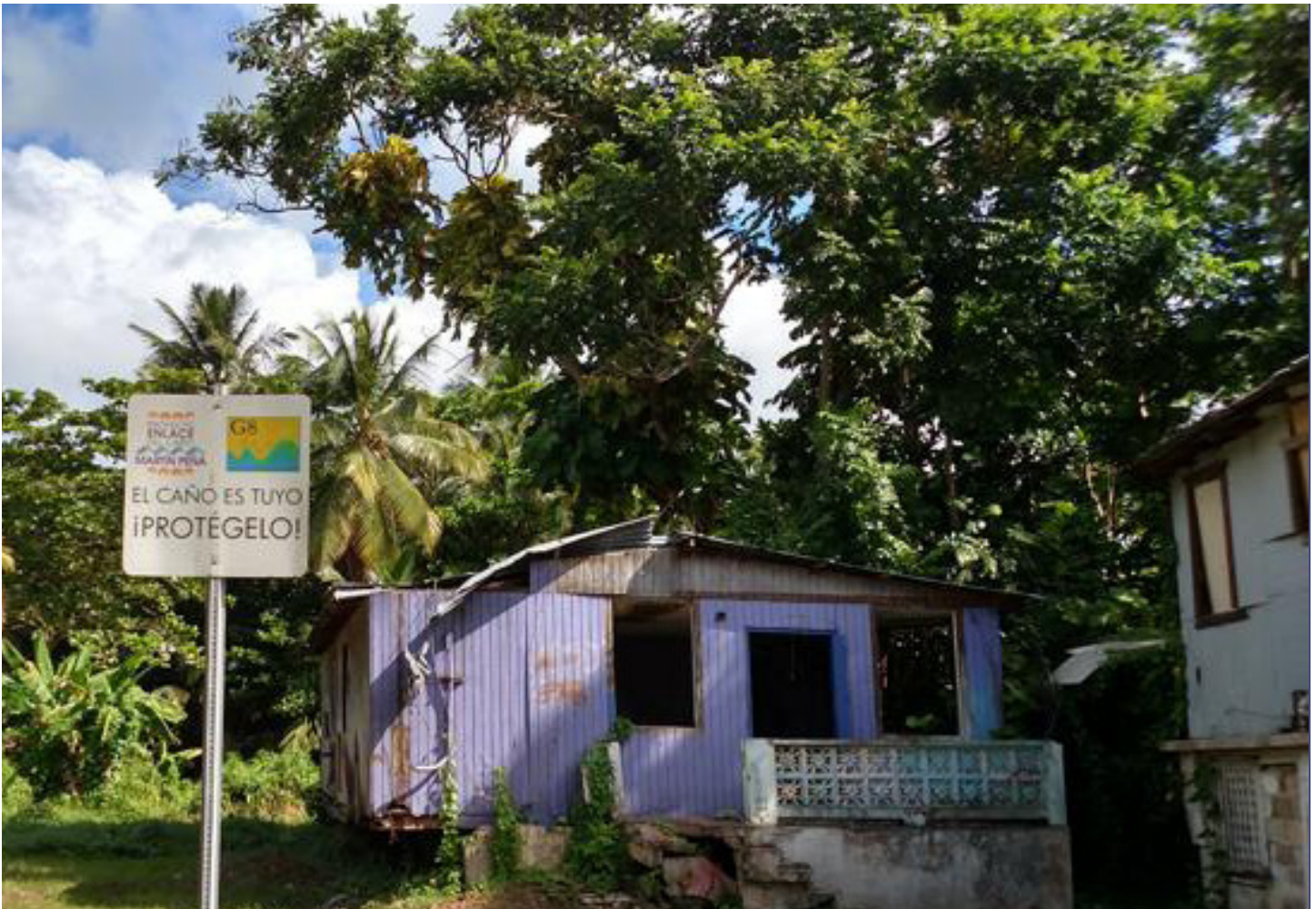
Figure 11: Informal settlements (Laura Bachmann 2017).