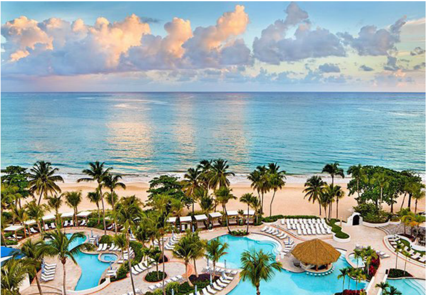
Figure 9: Fairmont El San Juan Hotel (Planetware 2021)