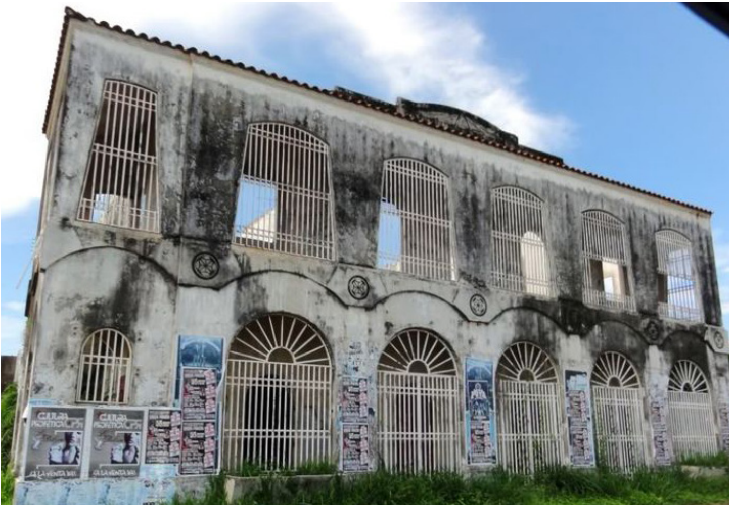
Figure 13: Abandoned house 1 (Pinterest 2021)