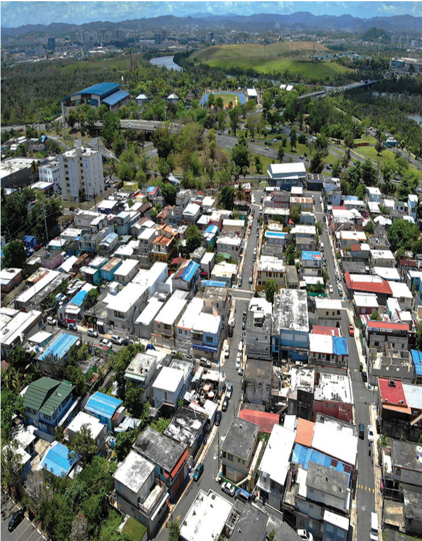
Figure 12: Informal Housing (APA 2019).