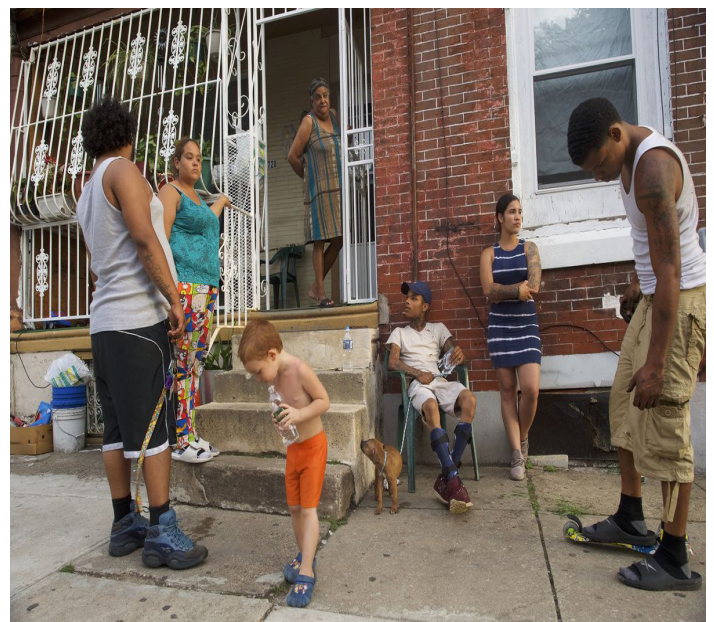
Figure 8: Displaced Puerto Ricans ( ARELIS R. HERNÁNDEZ 2018)

The disparity between tourists and locals is exacerbated by tourism. Although tourism is an important means of stimulating economic development, it inevitably encroaches on local people's land and labor force, displacing and exploiting locals in tourist hotspots. Following that, we'll look at some examples of tourist attractions to see how they alter buildings and landscapes, as well as the living conditions of native Puerto Ricans. Figure 8 shows the displaced Puerto Ricans