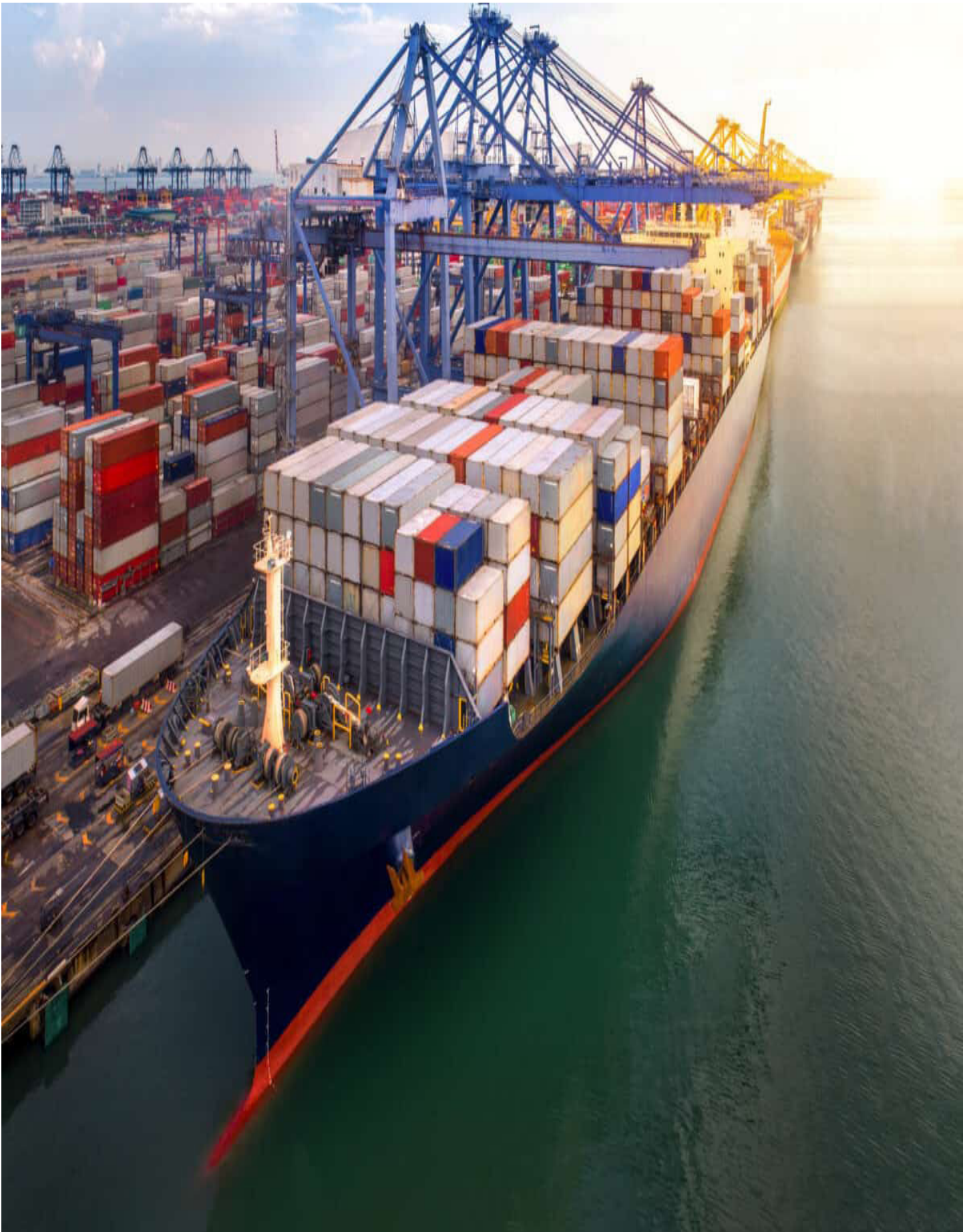
Figure 5 International shipping Puerto Rico (Latin America Cargo 2021)