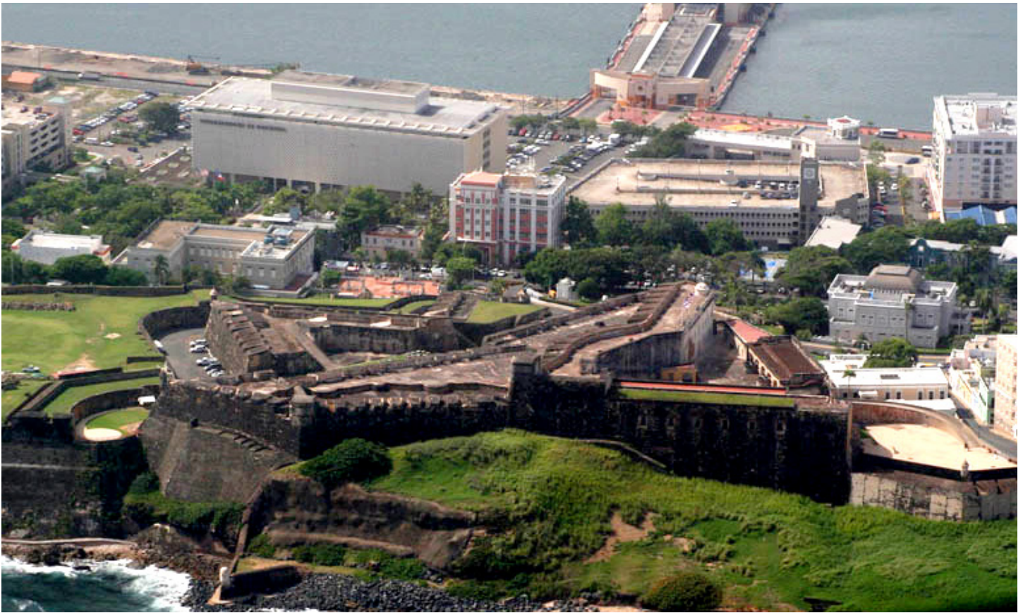
Figure 1 San Cristobal fortress (Wikipedia 2021).