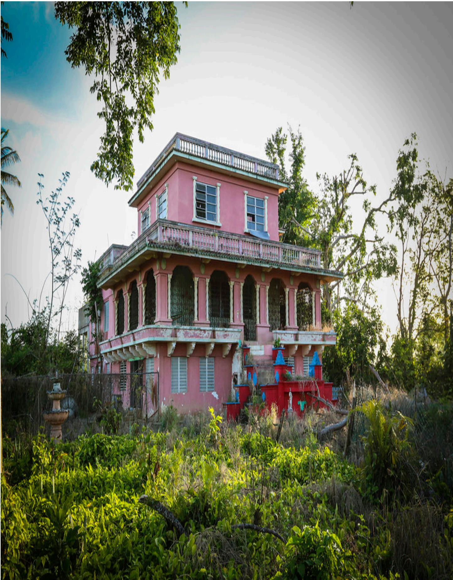
Figure 14: Abandoned house 2.