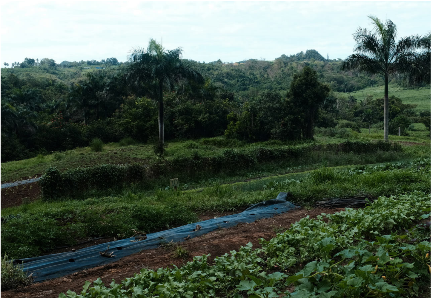
Figure 4: Puerto Rico's agricultural sovereignty (Life thyme 2021)

popular among this group of tourists by the 1990s.