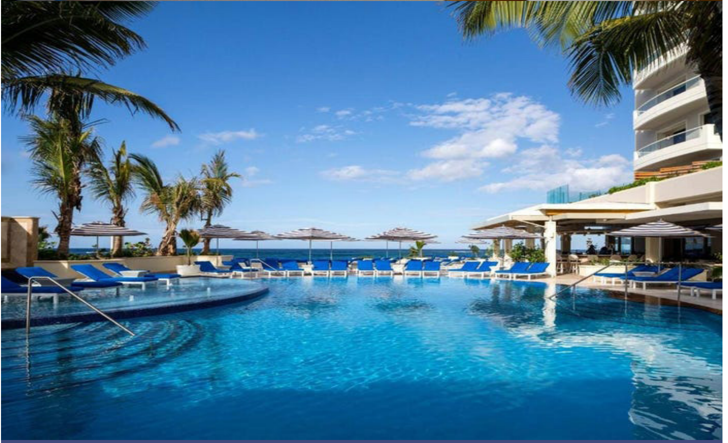
Figure 10: Dorado Beach, A Ritz-Carlton and Condado Vanderbilt Hotel (Insider 2021)