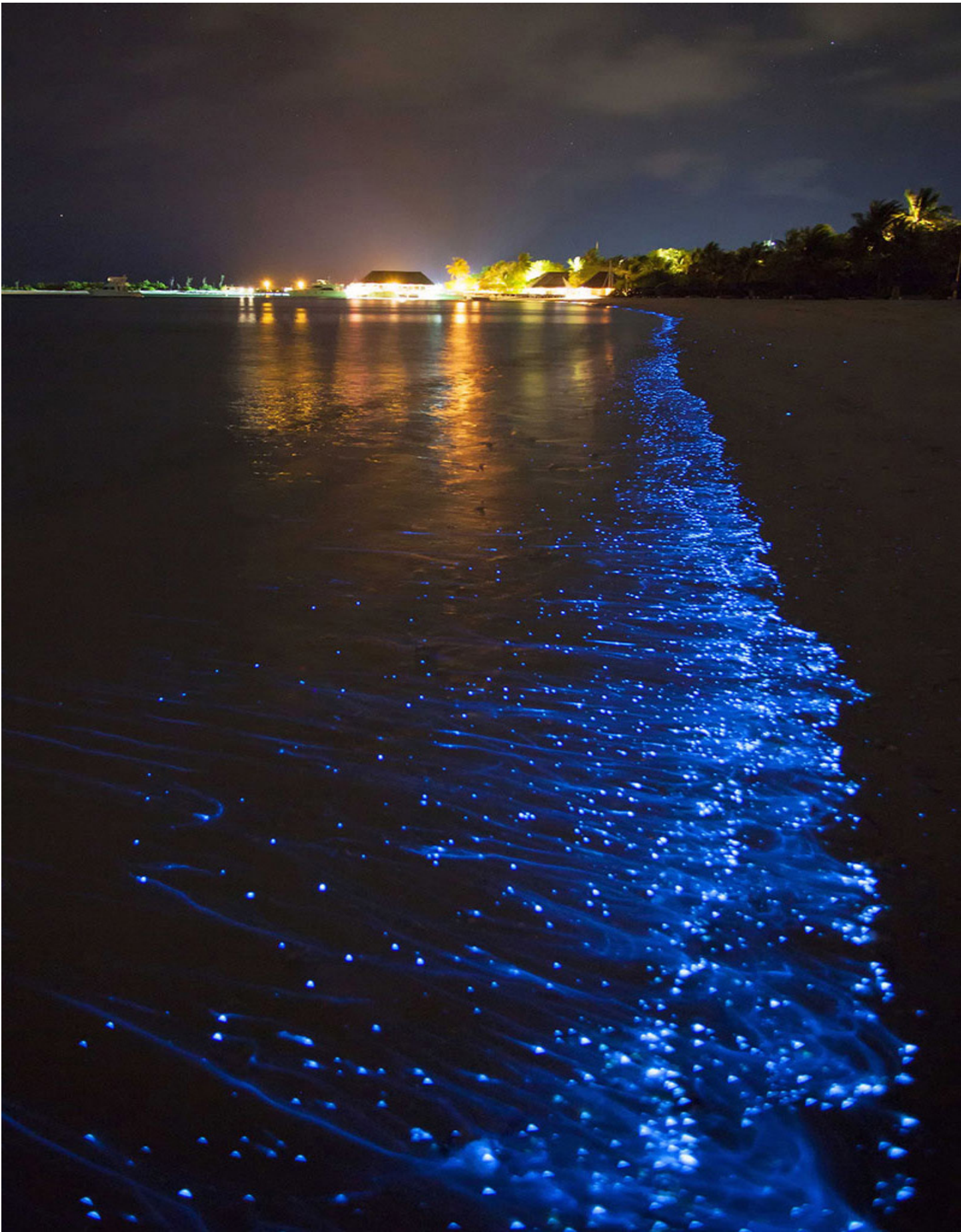
Figure 7: Bioluminescent Bay