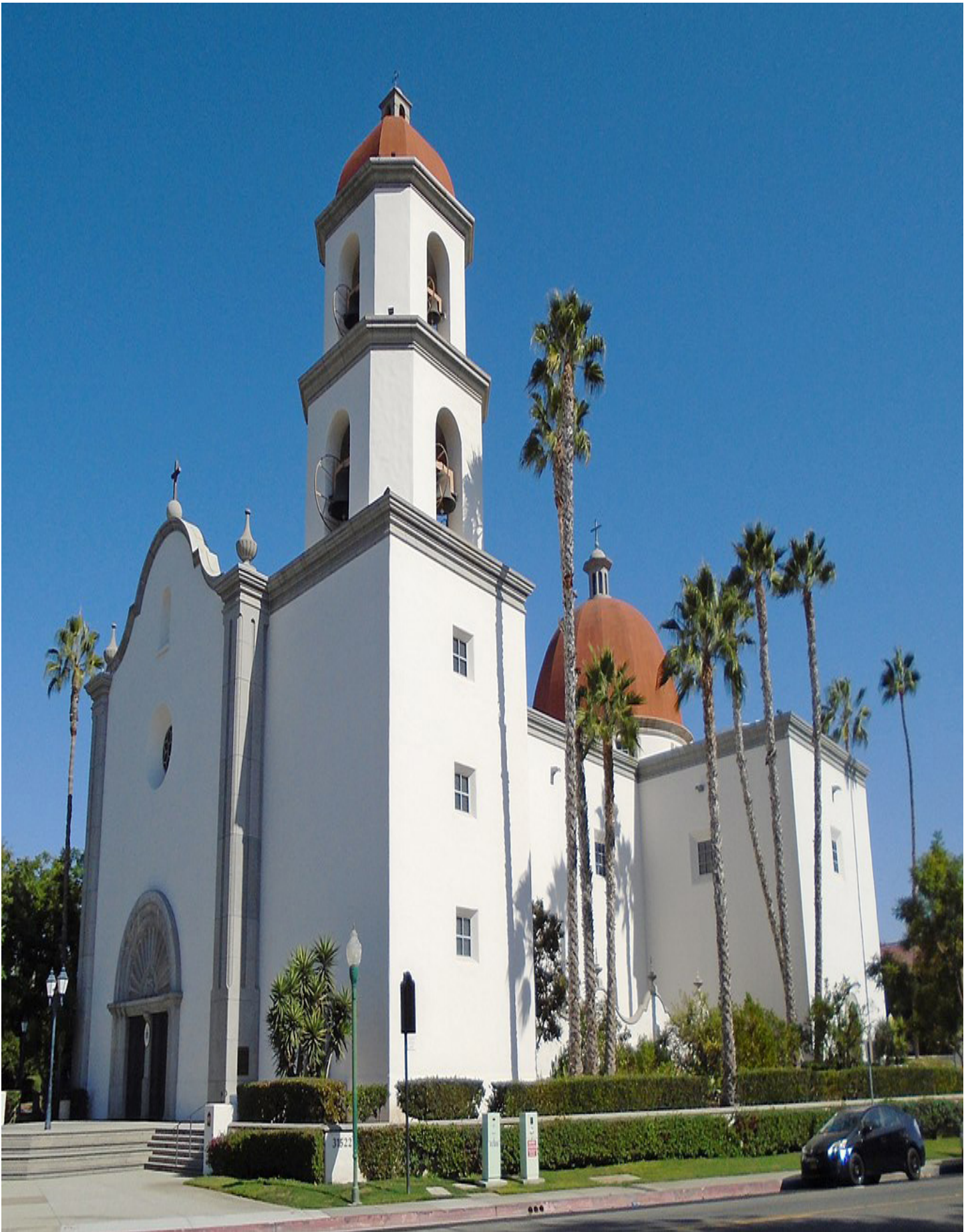
Figure 16: The Mission Basilica San Juan Capistrano (Wikipedia 2021).