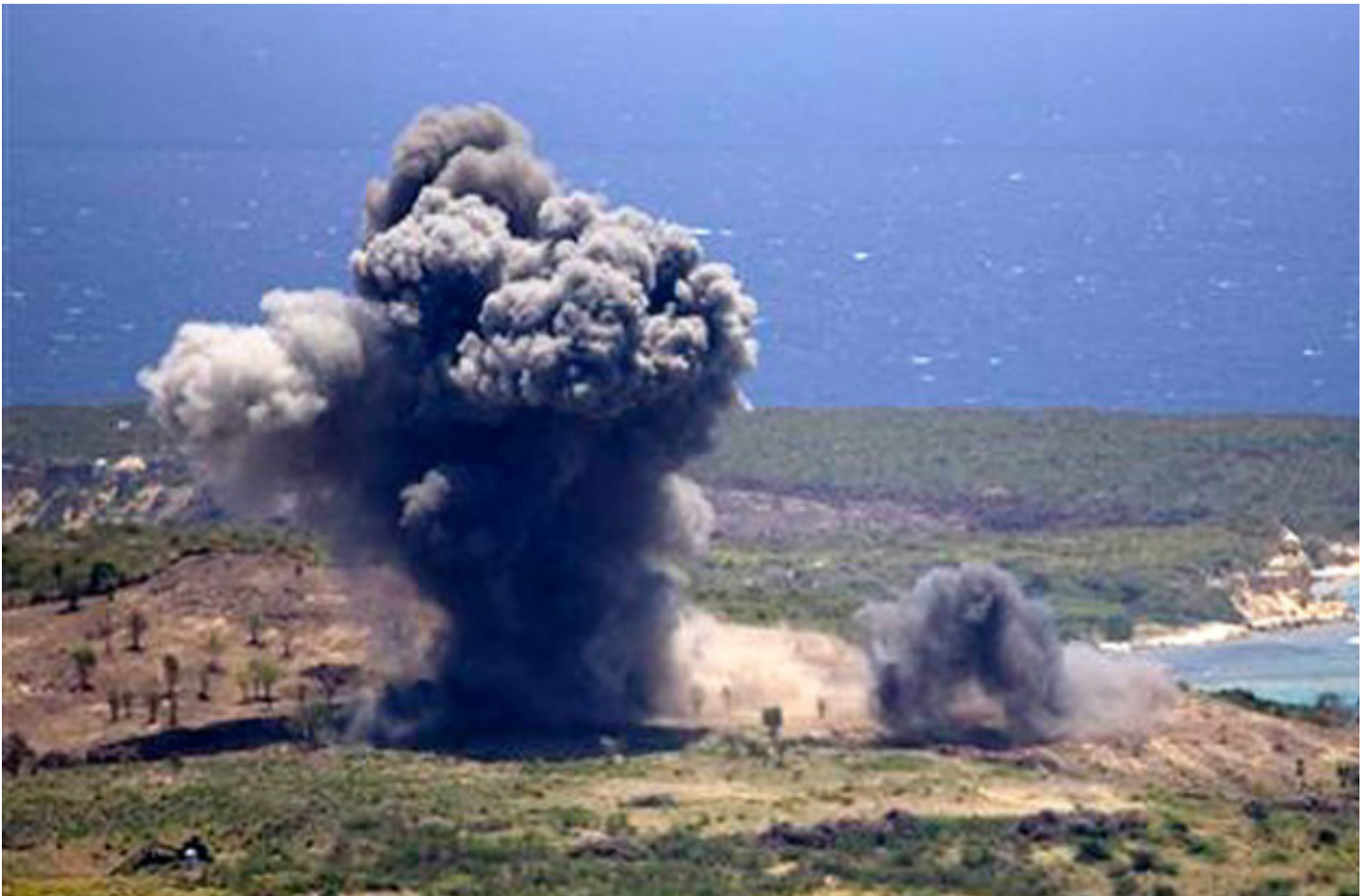
Figure 6: Clearing out in Vieques (Repeating Islands 2011)