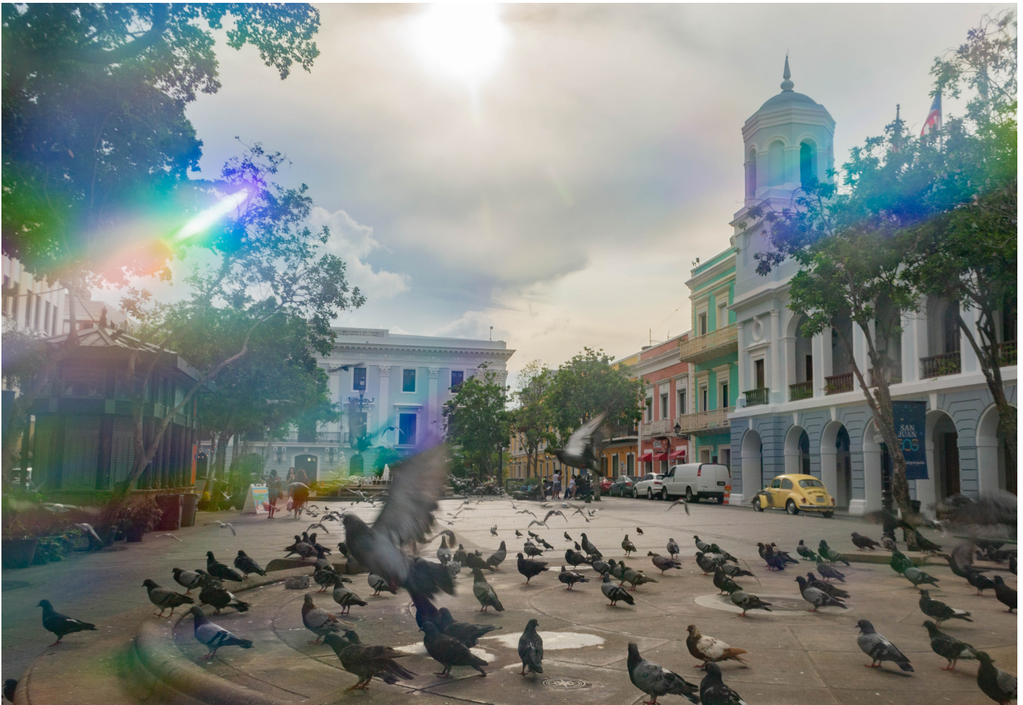
Figure 15: Old San Juan