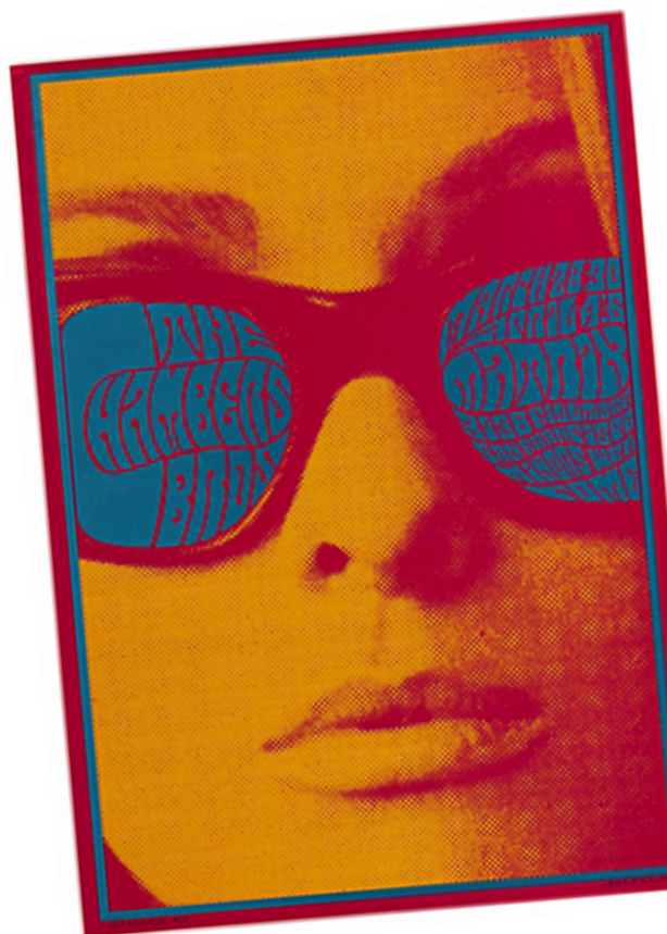
Victor Moscoso, The Chambers Bros Concert Poster, 1967, screen print, from Saratoga Performing Arts Center's exhibit, "Chromatic Scales: Psychedelic Design"

INSIDE: MiSci to reopen in June; Park Playhouse announces two summer shows