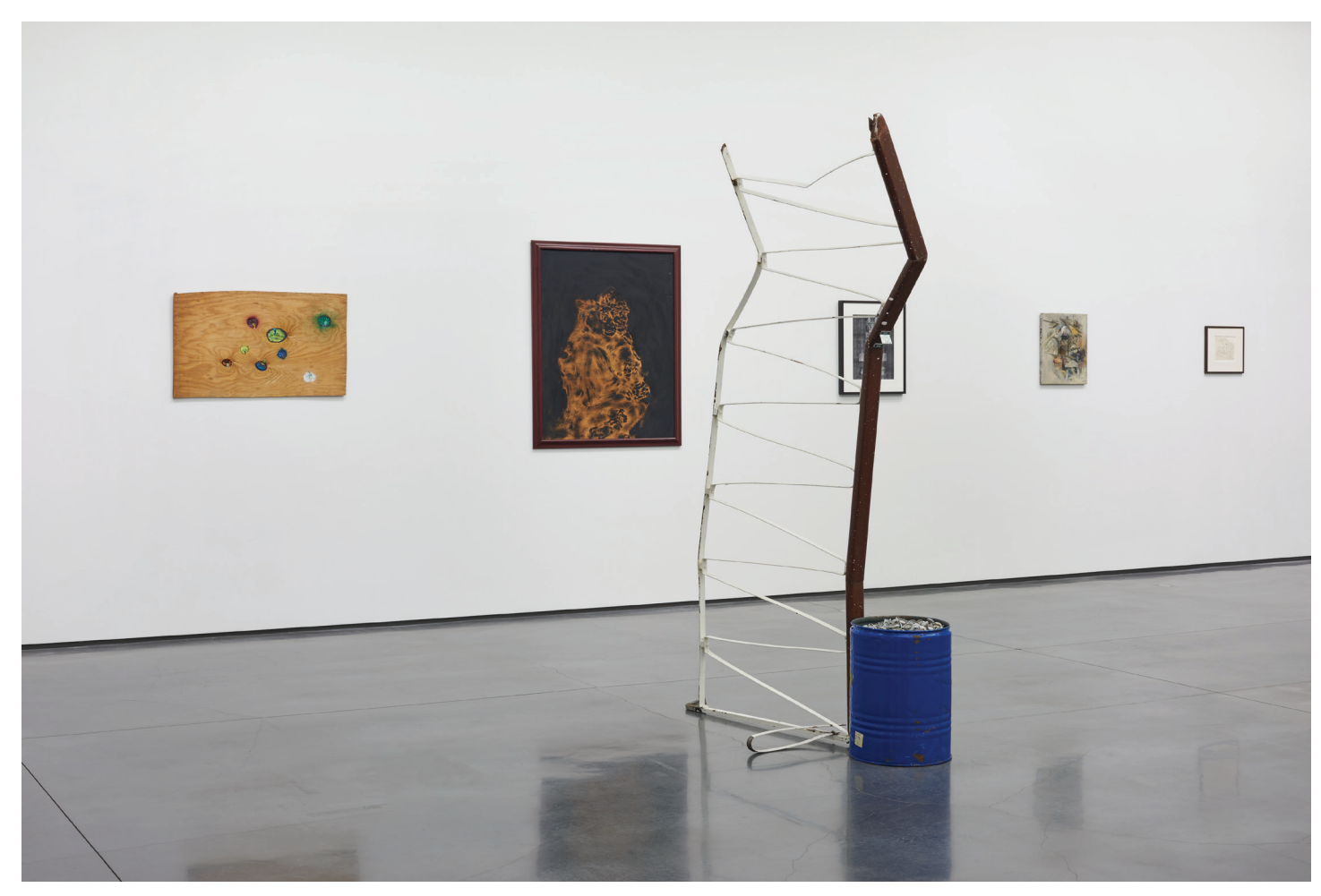
Installation view: Second Chances, 2015.