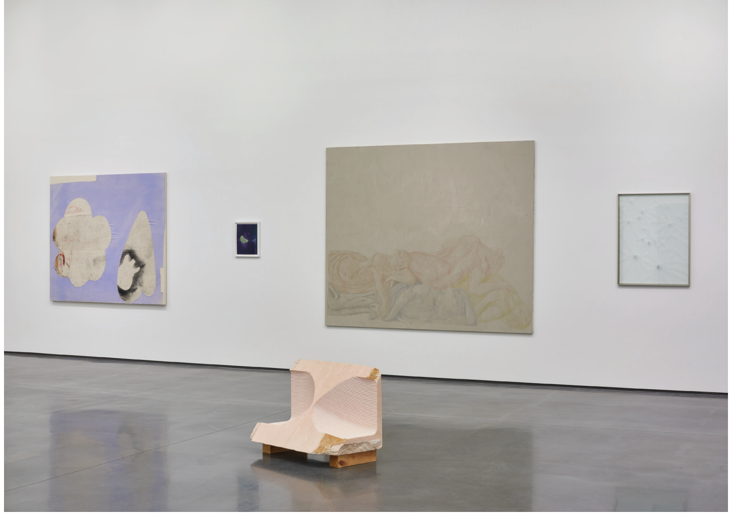
Installation view: Second Chances, 2015.

Examining the conditions of second chances, this group exhibition centers on the idea of the fresh start as well as scenarios of repetition that afford the opportunity for new resolutions. Attentive to the moment in a second chance when outcomes are invisible yet full of potential, the inherent tenet of this exhibition is one of hopefulness.