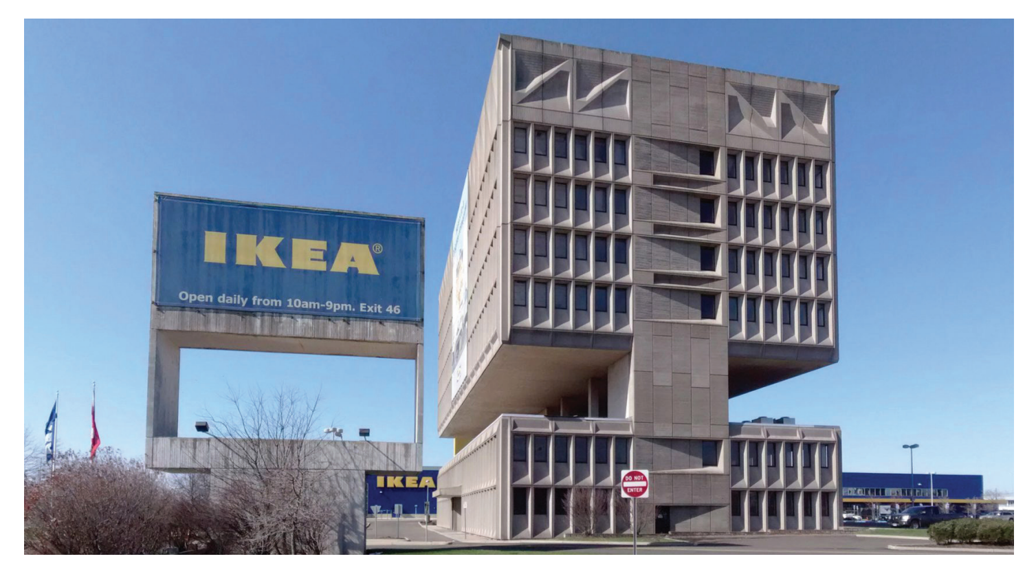
Architecture + Historic Preservation Joint Studio | Fall 2019 Critics: Mark Rakatansky + Kim Yao

The latter effect has been characterized by the architectural historian Barry Bergdoll as Breuer's "Heavy Lightness." In contradistinction to modernist glass building of that time, Breuer experimented with innovative concrete and masonry forms of construction, engaging iterative forms of modular geometric patterning in low and high relief. Considering the renewed interest in innovative adaptive use of modules in architecture today, this studio will explore the dynamic and iterative modulation not only of tectonic modules and structural modules, but the underlying assumptions regarding the modularity of rooms, of programs, of civic identities and urban formations. In other words, we will be rethinking and reworking the underlying assumptions of the politics of the module today and how it may evolve.