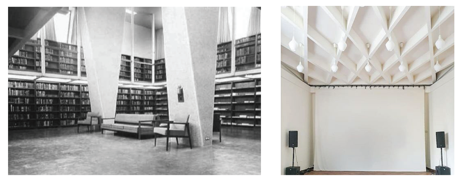
LEFT: Marcel Breuer, Library in US Embassy in The Hague (1959-61). RIGHT: Marcel Breuer, Auditorium in US Embassy in The Hague (1959-61).

In the Cold-War postwar period in which this American Embassy was built, along with many others by significant modern architects, there was a propagandistic initiative to temper the bureaucratic image with one of hospitality. Auditoriums, libraries and galleries were included in these buildings to entice local residents to visit the Embassy on a regular basis: to read and view and watch the very latest art, books and magazines, and movies from America. In various ways the actual current plans to reuse the building for a 50 room hotel and a new home for the museum of the Dutch artist M. C. Escher resonates with this mixture of a commercialized cultural hospitality, the circulations and mixings of local and non-local culture, residents and non-residents. If Escher's etchings intensify the unsettling of habitation through the relational interplay of architectural elements and spaces, new modes to operate on elements and spaces may be found to engage the temporal uncanny "residency" experienced as a non-resident in a hotel or a museum. We will be exploring this programmatic co-incidence of hotel and museum, and as an augmentation to these two programs, there is the option to consider other programs relevant to the local, national, and global questions of inhabitation in the Netherlands (the refugee situation, nationalism, sustainability, among others).