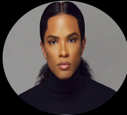
JAMAAL BUSTER @jamaalbuster

Entertainment/ TV Personality IG Verified 474K