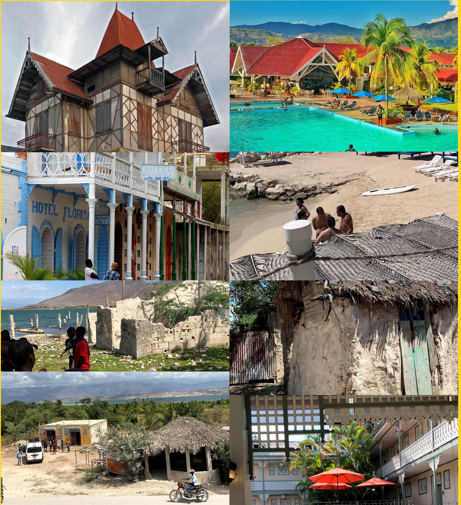
COLLAGE SHOWING A MIZ OF TAKEN IMAGES AND SEARCHED ONES