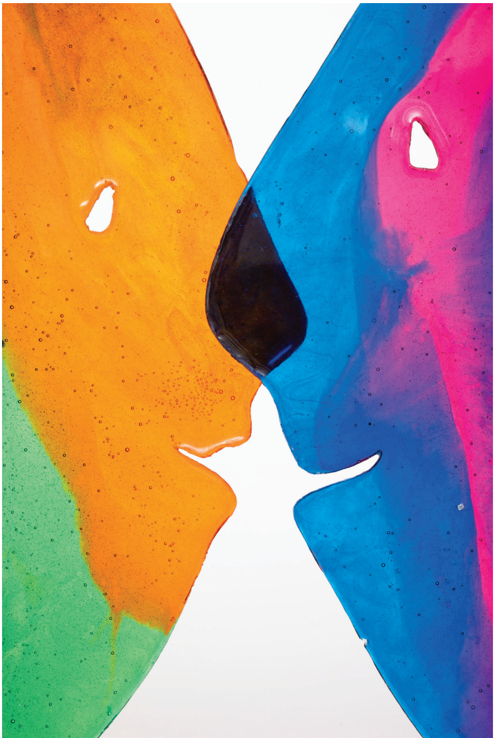
Gaetano Pesce, Two Faces frame , 2021. Polyurethane resin, 12 × 12 × 2.5 in. Courtesy the artist and Salon 94 Design. Photo Clemens Kois