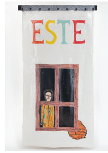
Este Skin , 2022 Polyurethane resin 95 × 36 in.

The earliest of the three Skins exhibited here, Friend Skin belongs to an ongoing series—including lamps and furniture—portraying friends and acquaintances through design objects. Echoing Pesce’s motto that “architecture should be a portrait of those who inhabit it,” these works remark the artist’s position in favor of the use of figuration and against seriality and conformity in design, seeking to endow each creation with a unique, unrepeatable character reflecting the diversity of society.