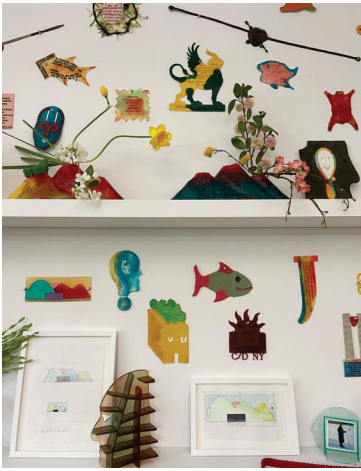
Display of materials from the artist's studio in Brooklyn

Gaetano Pesce's upcoming project for the Aspen Art Museum façade began as a drawing, which is displayed here with additional sketches for the exhibition catalogue and resin invite. The artist produces a bespoke resin invitation for each of his shows; a selection from the artist's personal archive spanning the last fifty years is presented here. For My Dear Mountains , Pesce produced a special invite design which evokes his design for the upcoming museum façade and also functions as a bracelet. . Displayed on the shelves are also the scale models handmade by the artist for the works Este Skin , Face Mirror , and Leaf Cabinet .