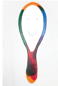
Face Mirror , 2022 Polyurethane resin, mirror 77 × 27 × 1 in.

In the artist’s words, “resin is the paper of our time.” Choosing this material is a way of asserting and embodying with sincerity the epoch that Pesce identifies with and belongs to. The artist approaches the bidimensional compositions of the Skins as figurative forms of storytelling which expand his radical pursuit of social and political expressions through design. In Pelle Burattino (Puppet Skin) , a puppet is accompanied by a sentence in Italian, reading: “This figure supported by wires is the last one to still believe in equality...”.