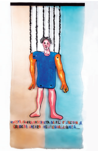
Pelle Burattino (Puppet Skin) , 2019 Polyurethane resin 47.24 × 81.5 in.

Este Skin is the most recent—and perhaps the most painterly—of the three Skins in the exhibition. The image of a child at the window stages Pesce’s distant childhood memory of traveling with his family to the city of Este, a small town in Veneto, Italy, located in proximity of mountains. The artist recalls standing by the window to look over the local, enchanting hilly landscape—a moment of contemplation of natural beauty that vividly came back to his mind while working on his project for Aspen.