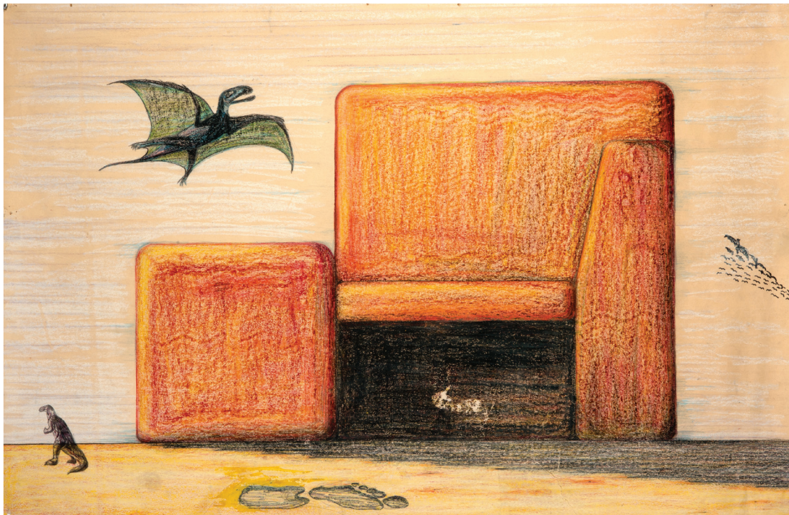
Gaetano Pesce, Yeti armchair , 1968. Color crayons on paper. 23.62 × 39.37 in.