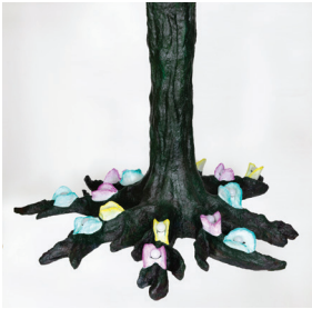
Tree Lamp, 2015-2022 Paper maché, foam, electrical 64.96 × 64.96 × 49.21 in.