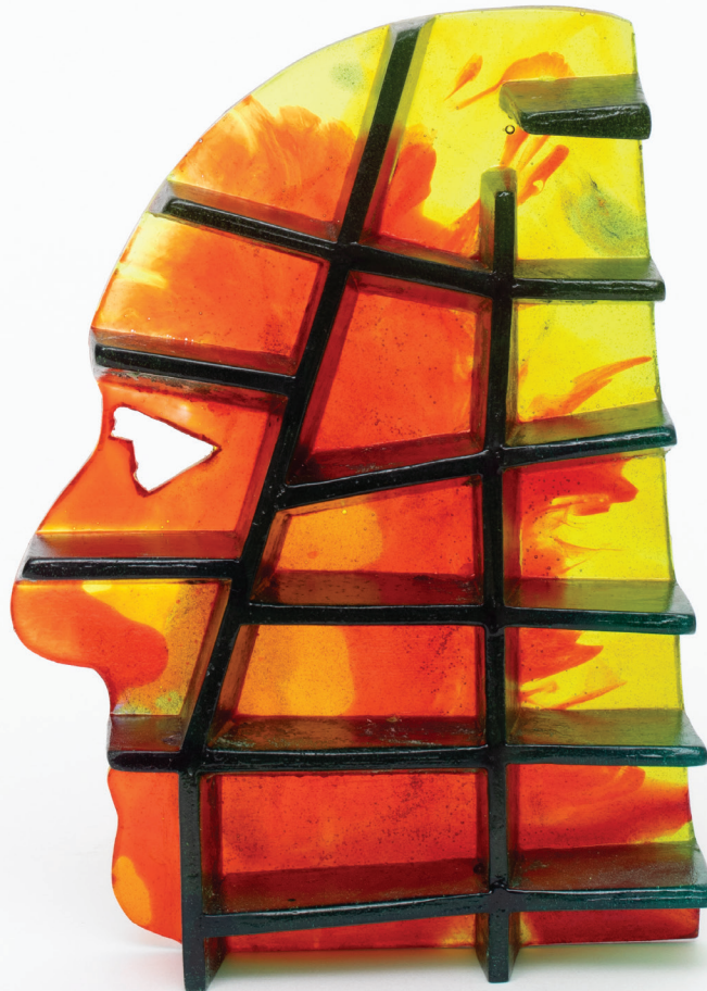
Gaetano Pesce, Self Portrait Cabinet (medium model), 2022. Polyurethane resin. 9.5 × 7 × 2 in.

Born in La Spezia, Italy, in 1939, Gaetano Pesce studied Architecture at the University of Venice between 1958 to 1963 and was a participant in Gruppo N, an early collective concerned with programmed art patterned after the Bauhaus. He taught architecture at the Institut d'Architecture et d'Etudes Urbaines in Strasbourg, France, for 28 years; Carnegie Mellon in Pittsburgh; Domus Academy in Milan; Polytechnic of Hong Kong; Architectural School of Sao Paulo; and the Cooper Union in New York City, where he has lived and worked since 1980. Pesce's work can be found in the permanent collections of over 30 national and international museums, including the Museum of Modern Art in both New York and San Francisco; Metropolitan Museum of Art in New York; Vitra Museum in Germany; Pompidou Center and Musée des Arts Décoratifs of Louvre in Paris; and Victoria and Albert Museum in London. His award-winning designs include the prestigious Chrysler Award for Innovation and Design in 1993, the Architektur and Wohnen Designer of the Year in 2006, and the Lawrence J. Israel Prize from the Fashion Institute of Technology in New York in 2009. Gaetano Pesce is represented by Salon 94 Design.