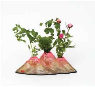
My Mountains, 2022 Polyurethane, felt 15.75 × 6 × 6 in. Unique in a series of 25

On the occasion of his exhibition My Dear Mountains at the Aspen Art Museum, Gaetano Pesce has created a limited series of 25 unique vases inspired by Aspen's natural landscape with the title My Mountains . Floral arrangements in the exhibition are by Eliza Ryan.