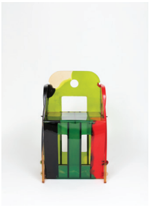
Jeanne Chair, 2022 Polyurethane resin 30 × 17 × 20 in.