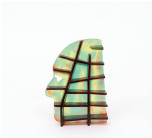
Self Portrait Cabinet (medium model), 2022 Polyurethane resin 9.5 × 7 × 2 in.

On the occasion of his exhibition My Dear Mountains at the Aspen Art Museum, Gaetano Pesce has created a limited series of 25 unique vases inspired by Aspen's natural landscape with the title My Mountains . Floral arrangements in the exhibition are by Eliza Ryan.