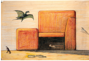
Yeti armchair , 1968 Color crayons on paper 23.62 × 39.37 in.

All works by Gaetano Pesce