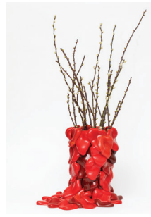
Mountain of Hearts , 2020 Resin 15.35 × 17.72 in.

The word "pesce" means "fish" in Italian, and conjures up a playful symbol that the artist likes to introduce into many of his works as a sculptural form as well as a nod to his own name. Swamp Coffee Table is shaped like a smiley fish, whose elaborate texture evokes the greenery of marshes and is achieved through the crafty combination of resin, papier-mâché and foam.