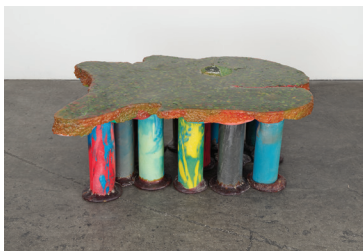
Swamp Coffee Table , 2015 Papier-mâché, resin, and polyurethane foam 18.5 × 51.18 × 36.22 in.

Many of Pesce's ideas first manifest as preparatory sketches and exploratory drawings, which provide an aesthetic and conceptual blueprint for the physical objects. Free from practical constraints, these germinal images show the full extent of the creative freedom driving the artistic process. While presenting one of Pesce's earliest designs for a couch, the Yeti armchair also reflects on the inevitability of time as a passing, mutating force—a notion that underpins much of the artist's work. Pesce's Yeti chair stands tall amidst a bare, otherworldly landscape in the company of dinosaurs, creatures whose destiny is doomed. A human footprint marks someone's fleeting presence, while birds in flight offer another image of impermanence. Casting its shadow to the ground, the Yeti armchair cannot withdraw from the flow of time either.