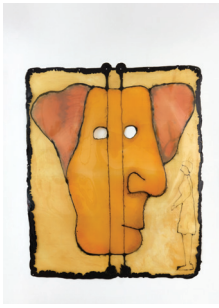
Friend Skin , 1995 Polyurethane resin 84 × 69 in.

The earliest of the three Skins exhibited here, Friend Skin belongs to an ongoing series—including lamps and furniture—portraying friends and acquaintances through design objects. Echoing Pesce’s motto that “architecture should be a portrait of those who inhabit it,” these works remark the artist’s position in favor of the use of figuration and against seriality and conformity in design, seeking to endow each creation with a unique, unrepeatable character reflecting the diversity of society.