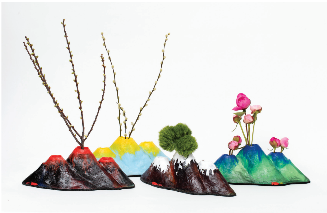
Gaetano Pesce, My Mountains, 2022. Polyurethane, felt. Unique in a series of 25. 15.75 × 6 × 6 in. Courtesy the artist and Salon 94 Design