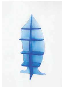
Leaf Cabinet, 2022 Polyurethane resin 84 × 38.5 × 16.75 in.

Restored and reworked specially for this exhibition, Tree Lamp takes the organic forms of a tree trunk and its roots to create a chandelier attached to the gallery ceiling, as if growing through it.