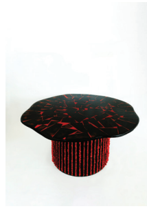
Tavolo Pezzi Feltro (Felt Pieces Table), 2019 Felt, resin base wood, resin 28.86 × 32.17 × 57.09 in.

This iconic piece is exemplary of Pesce's experimental approach to the use of materials, and testifies to his productions being themselves forms of research into the physical properties of resin. In the case of the XXL Foot Vase, the particular resin employed allows for a twenty-five minute window before it turns rigid and becomes unworkable. It is by pushing the boundaries of what the material constraints allow that Pesce uniquely achieves this kind of aesthetic result on a large scale.