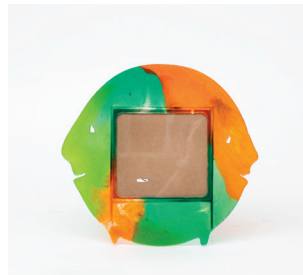
Two Faces frame, 2021 Polyurethane resin Two sizes: 12 × 12 × 2.5 in. 6.5 × 13 × 1.33 in.