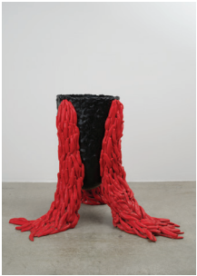
XXL Foot Vase, 2011 Polyurethane resin 36 × 43 × 37 in.

Gaetano Pesce's upcoming project for the Aspen Art Museum façade began as a drawing, which is displayed here with additional sketches for the exhibition catalogue and resin invite. The artist produces a bespoke resin invitation for each of his shows; a selection from the artist's personal archive spanning the last fifty years is presented here. For My Dear Mountains , Pesce produced a special invite design which evokes his design for the upcoming museum façade and also functions as a bracelet. . Displayed on the shelves are also the scale models handmade by the artist for the works Este Skin , Face Mirror , and Leaf Cabinet .