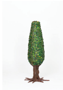
Tree Vase Ciproso , 2016 Polyurethane resin and papier-mâché 39.37 × 9.84 × 9.84 in.

Vases are favorite functional objects in Pesce's oeuvre, providing the artist with a framework to develop and iterate different motifs. Hearts are a relatable symbol expressing love, friendship, and emotions.