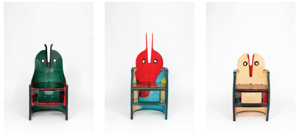
Three chairs from the Nobody's Perfect series:

According to Pesce, the original idea for this type of felt-based object came to him one day as he was walking down the street in New York and noticed some fabric in the gutter soaked with street water. Captured by the plasticity of the soft folds, the artist imagined the possibility of creating hard-bodied volumes using felt soaked into resin. Tavolo Pezzi Feltro is a testament to Pesce's pioneering pursuit of innovative production techniques to activate rigidity within softness.