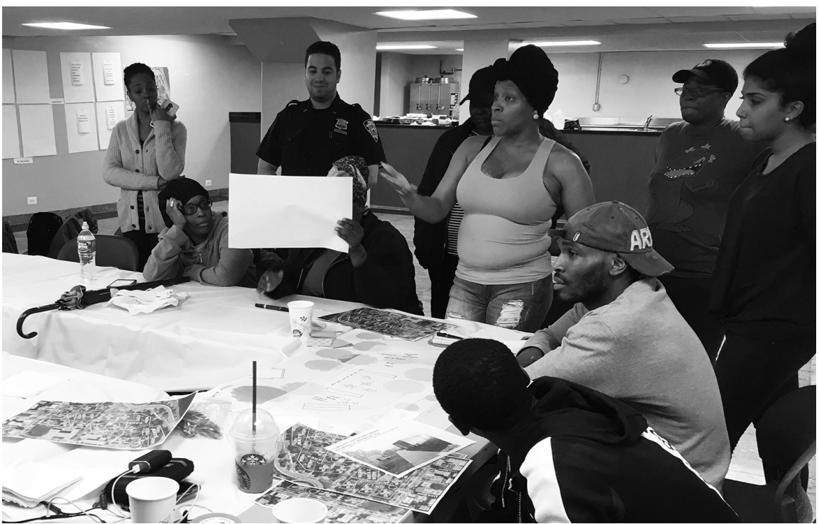
Community Design Fellow Meeting with East Harlem residents, 2018

It is our obligation to not only "take" time and knowledge from these groups, but offer something in return. Over the course of the summer, we will discuss in more detail, the content and format of the way in which we can contribute to the community in each of the five neighborhoods.