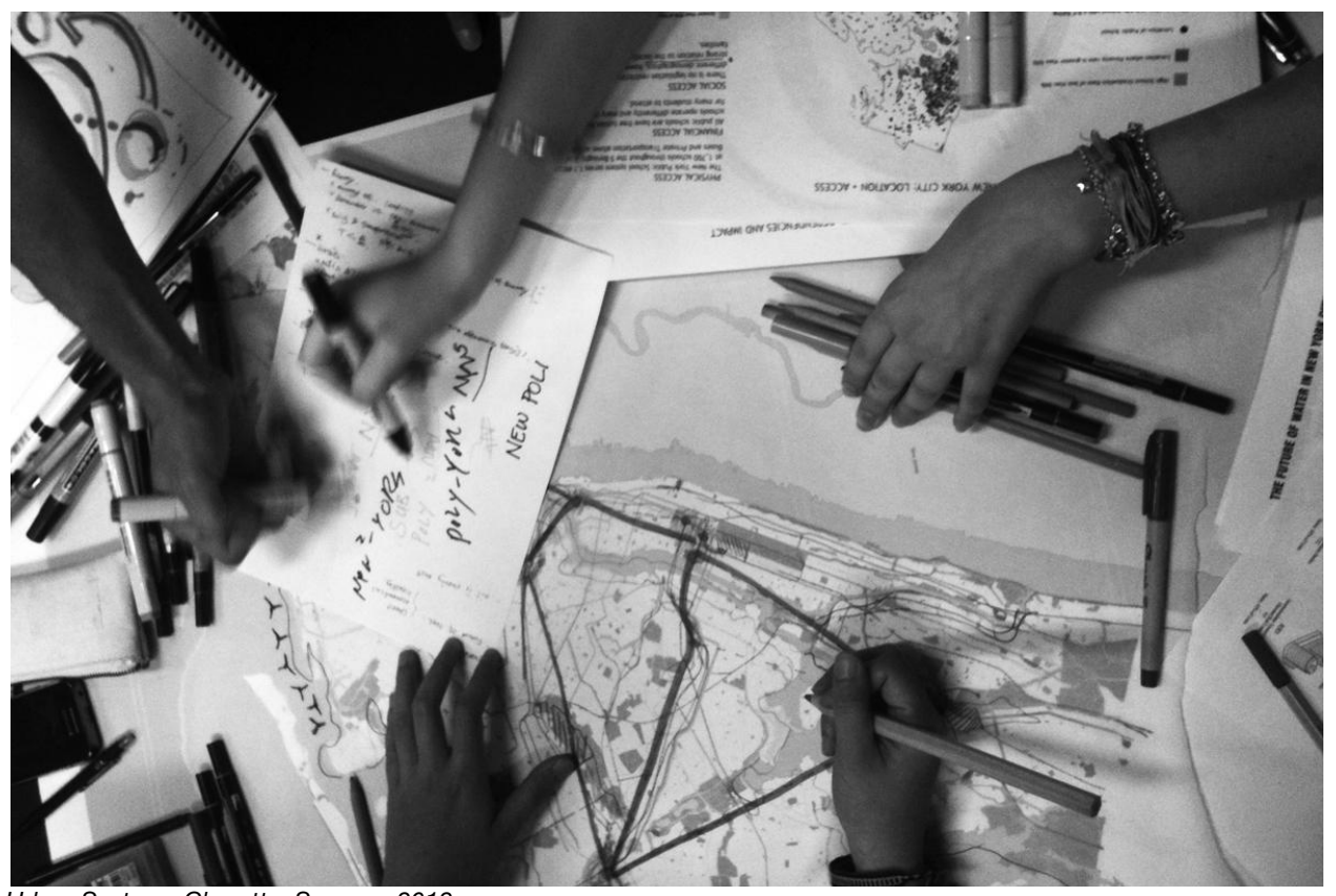
Urban Systems Charette, Summer 2012

Urban Design is teamwork. Practicing how to communicate in teams, how to negotiate different interests, challenges and strengths, both visually and verbally is an important aspect of urban design. For each of the distinct parts of this semester you will be asked to work in teams of different size and constellation. Similarly, the faculty will work as team. You will meet and discuss your progress with each faculty member throughout the semester.