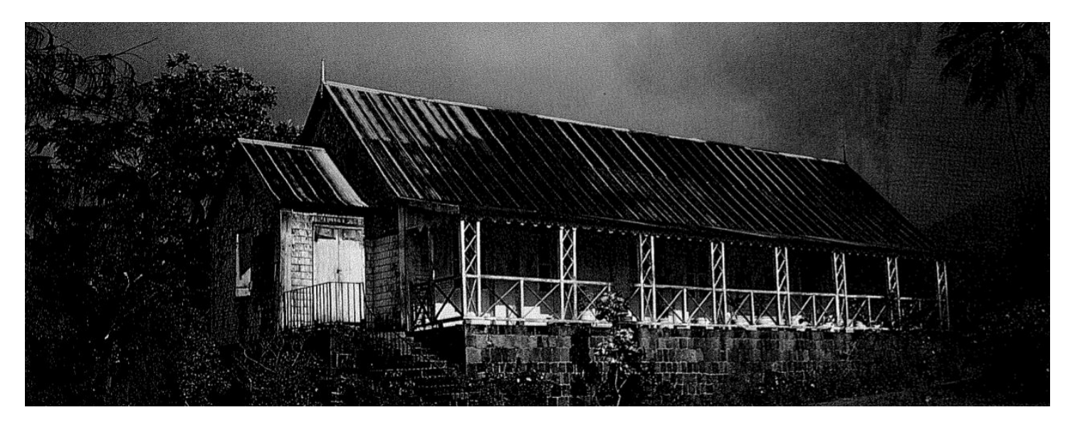
Figure 1: St Kitts Vernacular Architecture