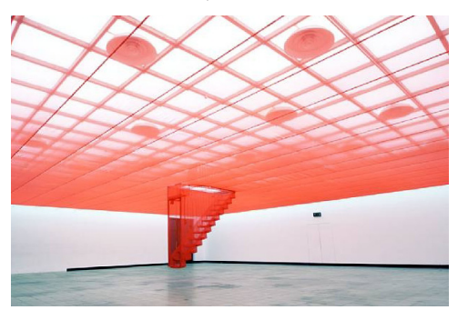
Do Ho Suh, Staircase, 2011