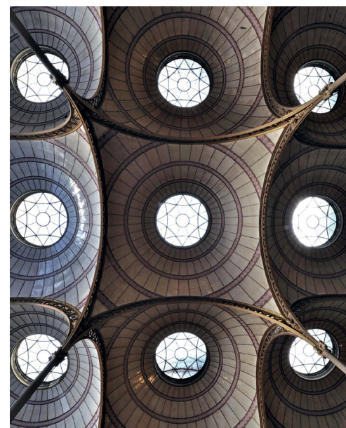
Henri Labrouste, Bibliotheque Nationnale, 1875

What are the benefits, problems and challenges with bringing more light or more shadow into our Libraries? What spaces are more conducive to light and what are more conducive to darkness (shadow)?