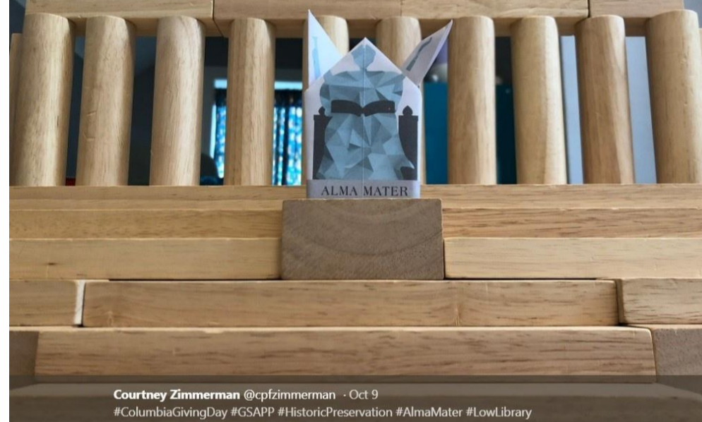
Courtney Zimmerman @cpfzimmerman · Oct 9 #ColumbiaGivingDay #GSAPP #HistoricPreservation #AlmaMater #LowLibrary #blocksarefun @ColumbiaGSAPP @Columbia

Columbia Giving Day is a time for the GSAPP community to voice its appreciation and support of the School. Friends, family, and alumni can make contributions towards supporting facility upgrades, travel stipends, and research opportunities through this link