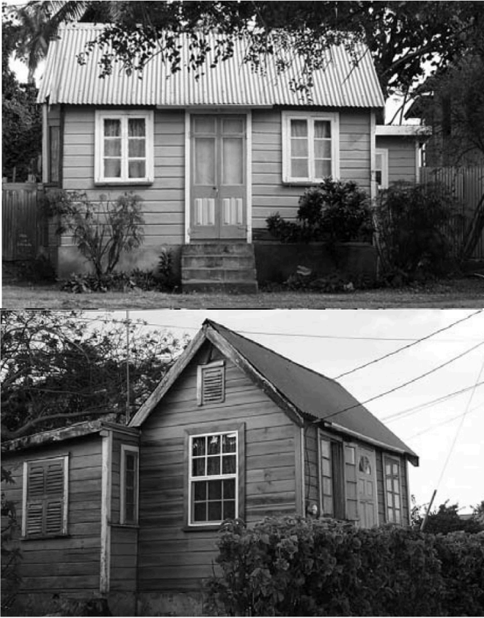
Figure 2: One-room and One-room with lean-to Chattel Houses.

the onset of the slave trade. There is growing support for roots tourism sites in places other than Africa. The sites are “where material evidence of the legacy of slavery still stands before their eyes and is available to be touched, walked through, and experienced with all of their senses and with the movement of their bodies through the space.” 11