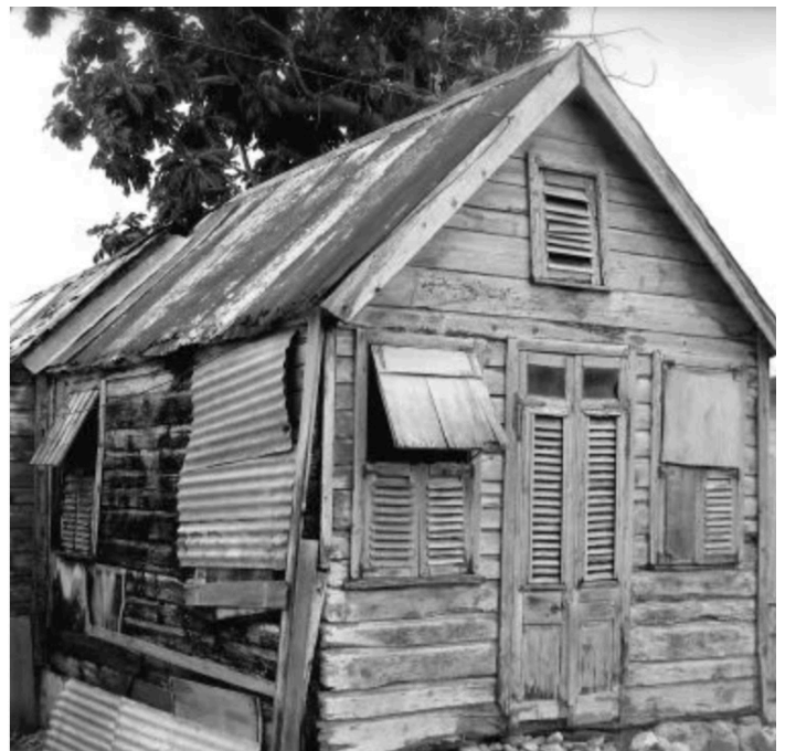
Figure 6: Bridgetown Chattel House.

Hopefully, root tourism sites will become a priority in Barbados and other locations worldwide as the sites contains necessary healing for some: "at the destinations of roots tourists, the concept of memory is active and fluid as in the performative, human function of "re-membering", that is, putting back together, restoring the body, making whole the body politics. As a bodily practice, memory performed at these sites serves a temporal spatial function by incorporating the awareness of sight, sound, smell, touch and taste to fully experience the spatial arrangement of the memorial." 17 A future chattel house heritage tour and other emerging root tourist locations will assist roots tourists in their quest for places of memory to honor their ancestors.