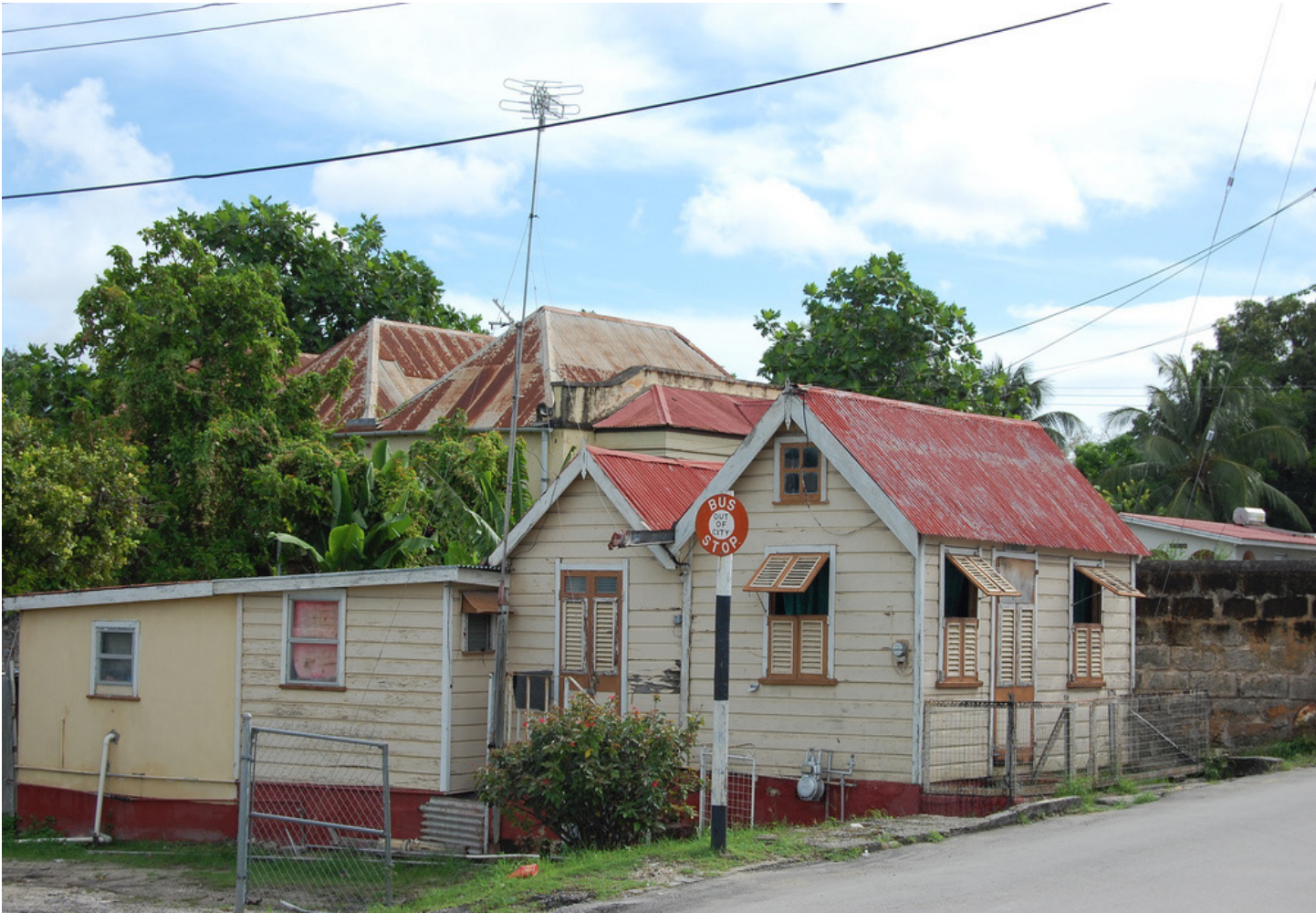
Figure 7: Chattel House with additions.