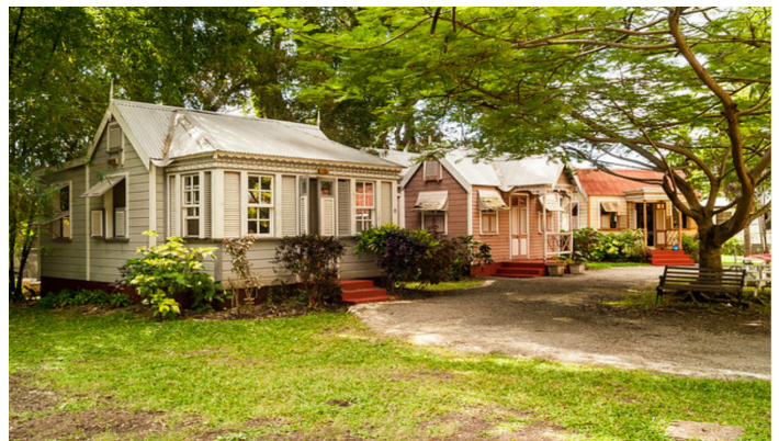
Figure 5: Tyrol Cot Heritage Village.

Bridgetown. One of the roads in Speightstown is called Farm Road. This cluster was located using a map from the 1800s, which showed a plantation near Farm Road. Google street view also yielded results near plantations which are current tourist sites. An extensive survey by preservationists or city officials should document all the extant chattel houses. Chattel houses are an essential part of Barbados’ architectural and cultural history, and they should be identified and preserved.