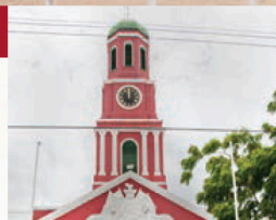
Figure 1: UNESCO sites, Barbados.

The Clock Tower was constructed in 1803, adding to the exceptional composition of this military space with its unique George III Coat of Arms, in Coade stone. Visit the Clock Tower at noon every Thursday (November- April) for the opportunity to witness the changing of the sentry, which is a traditional military tribute dating back to the 1700s!