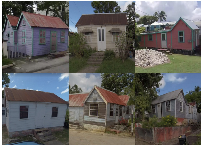
Figure 4: Chattel Houses in Barbados.

Authentic chattel houses are found all over Barbados. The research for this bulletin used google street view to identify some areas which contain extant chattel houses. Many of the homes on side streets could not be located since google street view provided no imagery of those areas. Yet, clustered chattel houses were identified, especially in Speightstown, Holetown and