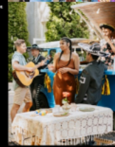
Understanding Our Target Audience