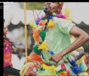
Exploring Event Details

A vibrant mix of art exhibitions, live music performances, and DJ sets awaits at the Liberti Festival.