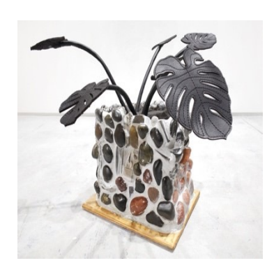
On Floor: Ballad for a Child II , 2020–21 Leather, stone, seashells, metal, and concrete