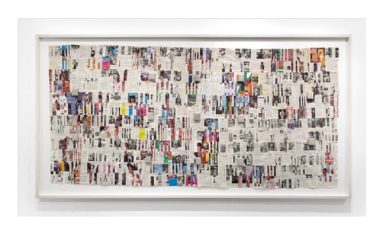
Jet Auto Archive–April 27, May 11, May 25, 1992 (Medicated L.A. Kente), 2018 Paper and cardboard Private collection