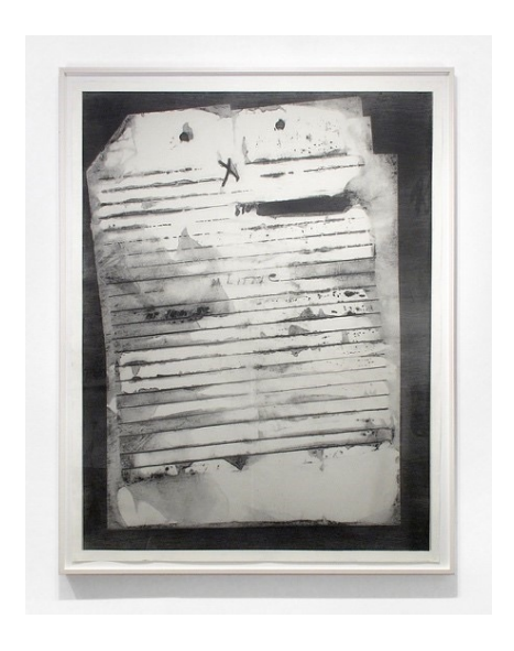
X Codex , 2008 Graphite powder on paper Collection of Greg and Alyssa Shannon