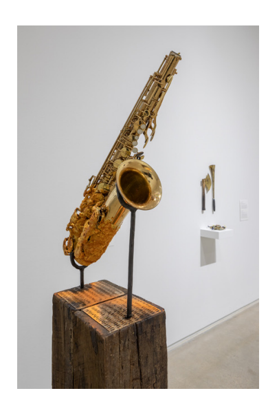
Texas Fried Tenor, 2012—ongoing Saxophone, flour batter, wood, and iron

Central to Cyrus's practice is his study of the ways in which music has both accompanied and advanced Black and global political movements. This is especially true of "trumpet music," which evolved from a crude sound generated through a conch shell to a rallying siren heard in both popular and military contexts. Imagining a survivalist synthesis of these applications in a post-apocalyptic battleground, Cyrus transforms discarded trumpet parts and brass into simple axes, clubs, and improvised explosive devices in this work. Crafting a rejoinder to the claim that "jazz is dead," he sets a stage for the undying capacity of music to adapt and endure.