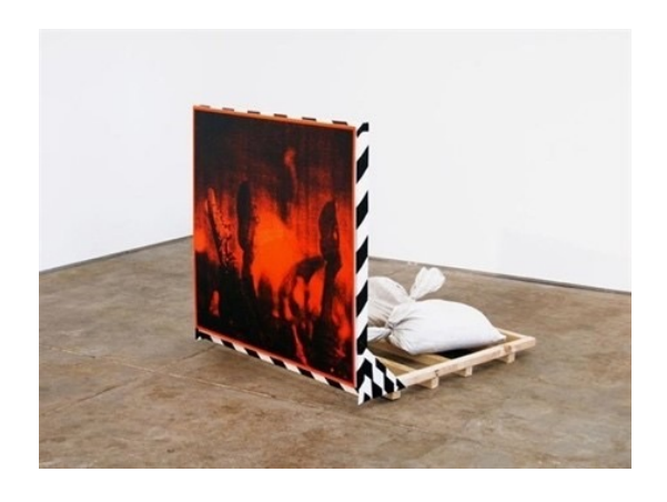
On Floor: FA/TA/HA -, 2011/2021 Digital print on Plasticore, sandbags, wood

Cyrus's interest in the revolutionary synergy of music and socio-political movements is further articulated in this 2011 installation, which has been remade for this exhibition. FA/TA/HA- also expands the artist's ongoing exploration of cultural interchanges that connect the United States to Egypt—in this case, drawing parallels between the Black Panther Party, Black Lives Matter marches, and the 2011 Day of Revolt in Cairo. Beginning in December 2010, unprecedented mass demonstrations against poverty. corruption, and political repression broke out in several Arab countries, challenging the authority of some of the most entrenched regimes in the Middle East and North Africa. Such was the case in Egypt, where in 2011 a popular uprising forced one of the region's longest serving and most influential leaders, President Hosnī Mubārak, from power. Cyrus invokes the uprising by covering a provisional barricade with an image of demonstrators marching in Tahir Square, raising their shoes in the air as if they were fists, thus suggesting both protection and provocation. The work's title, the combination of three Arabic letters, is reminiscent of a musical scale. Written in all capital letters as if shouting, it aptly translates to "for something to be opened."