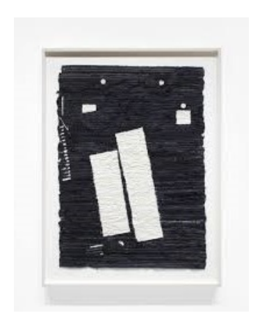
Like the Jungles in the Dead of Night, 2020 Blue denim, bleached denim, cotton thread Collection of Alisa Miller

In this work, Cyrus draws sobering parallels between the FBI's surveillance and intimidation of activistauthor Richard Wright in the 1960s (also seen in the work Captured Letter from Paris) and influential jazz singer Billie Holiday (1915–1959). In Holiday's now-legendary musical career, she notably refused to stop performing the 1939 ballad Strange Fruit despite numerous cease-and-desist directives from the FBI. Strange Fruit is now heralded as a trailblazing anthem for the civil rights movement in its protest of the horrific lynching of Black Americans by racist mobs across the United States. Her melodic defiance consequently raised the ire of notorious FBI Director J. Edgar Hoover, as well as a lower-level FBI-turned-Drug Enforcement Agency (DEA) agent Harry Anslinger, who became obsessed with keeping his agency relevant by taking down supposed illicit jazz clubs. His mocking description of jazz music sounding "like jungles in the dead of night" is recuperated here by Cyrus as the title of this homage to Holiday.