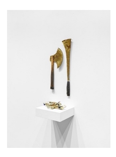
Conga Bomba, 2007–08/2021 Deconstructed trumpet parts, leather, tape Courtesy the artist

Central to Cyrus's practice is his study of the ways in which music has both accompanied and advanced Black and global political movements. This is especially true of "trumpet music," which evolved from a crude sound generated through a conch shell to a rallying siren heard in both popular and military contexts. Imagining a survivalist synthesis of these applications in a post-apocalyptic battleground, Cyrus transforms discarded trumpet parts and brass into simple axes, clubs, and improvised explosive devices in this work. Crafting a rejoinder to the claim that "jazz is dead," he sets a stage for the undying capacity of music to adapt and endure.