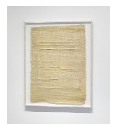
Duet, 2016 Laser-cut papyrus Private collection, Houston