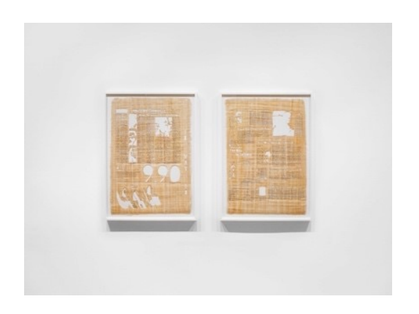
Eroding Witness, 2014 Laser-cut papyrus

Cyrus's interest in the revolutionary synergy of music and socio-political movements is further articulated in this 2011 installation, which has been remade for this exhibition. FA/TA/HA- also expands the artist's ongoing exploration of cultural interchanges that connect the United States to Egypt—in this case, drawing parallels between the Black Panther Party, Black Lives Matter marches, and the 2011 Day of Revolt in Cairo. Beginning in December 2010, unprecedented mass demonstrations against poverty. corruption, and political repression broke out in several Arab countries, challenging the authority of some of the most entrenched regimes in the Middle East and North Africa. Such was the case in Egypt, where in 2011 a popular uprising forced one of the region's longest serving and most influential leaders, President Hosnī Mubārak, from power. Cyrus invokes the uprising by covering a provisional barricade with an image of demonstrators marching in Tahir Square, raising their shoes in the air as if they were fists, thus suggesting both protection and provocation. The work's title, the combination of three Arabic letters, is reminiscent of a musical scale. Written in all capital letters as if shouting, it aptly translates to "for something to be opened."