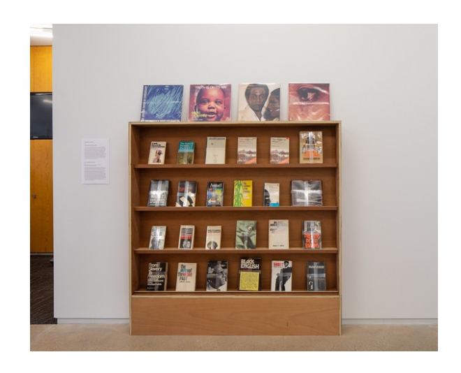
Pride Records Sighting at the Gary Convention of 1972, 2021

In Jet Auto Archive-April 27, May 11, May 25, 1992 (Medicated L.A. Kente), Cyrus remembers the brutal 1991 assault of Rodney King by Los Angeles Police Department (LAPD) officers, whose subsequent acquittal of all charges in April 1992 sparked a fiveday period of unrest and uprising across the city of Los Angeles. The ensuing congregation of images and words evokes messages embedded in traditional kente, such as names, proverbs, and prayers woven by its respective author. This iteration of Jet Auto Archive also includes several protective amulet packets drawn from African hunting traditions called "gris gris" in parts of West Africa and Louisiana. The pouches in this work contain folded-up pages from the "Saved" chapter of Malcolm X's 1965 autobiography, acknowledging how the Nation of Islam leader found epiphany, resolve, and salvation while incarcerated.