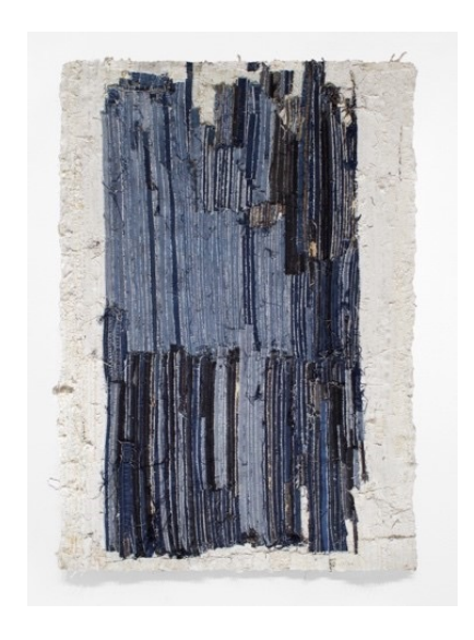
Ecstatic Blues Shape, 2019 Denim, cotton thread, bleach, and glue Private collection, Houston