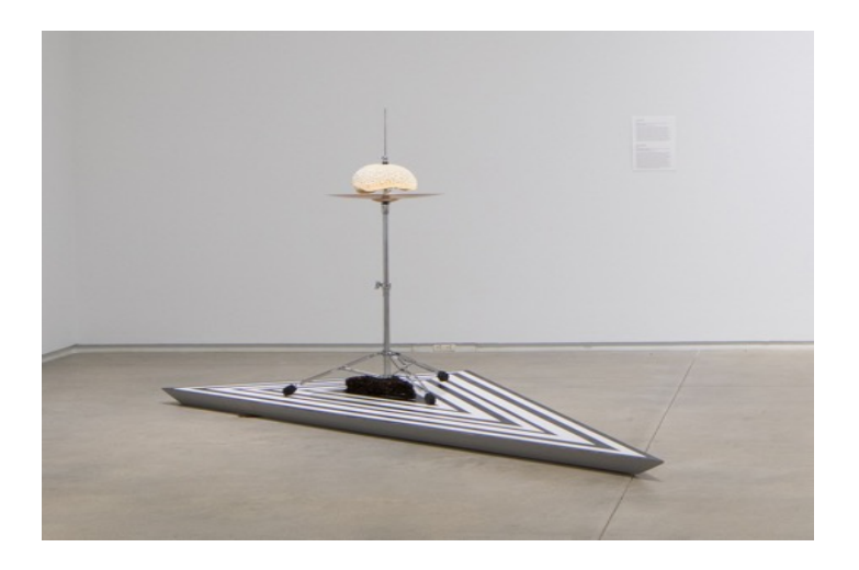
On Floor: Piece of the Sargasso Sea , 2009 Coral, cymbal, stand, seaweed, acrylic paint, pedestal Courtesy the artist and Inman Gallery, Houston

In this work, Cyrus draws sobering parallels between the FBI's surveillance and intimidation of activistauthor Richard Wright in the 1960s (also seen in the work Captured Letter from Paris) and influential jazz singer Billie Holiday (1915–1959). In Holiday's now-legendary musical career, she notably refused to stop performing the 1939 ballad Strange Fruit despite numerous cease-and-desist directives from the FBI. Strange Fruit is now heralded as a trailblazing anthem for the civil rights movement in its protest of the horrific lynching of Black Americans by racist mobs across the United States. Her melodic defiance consequently raised the ire of notorious FBI Director J. Edgar Hoover, as well as a lower-level FBI-turned-Drug Enforcement Agency (DEA) agent Harry Anslinger, who became obsessed with keeping his agency relevant by taking down supposed illicit jazz clubs. His mocking description of jazz music sounding "like jungles in the dead of night" is recuperated here by Cyrus as the title of this homage to Holiday.