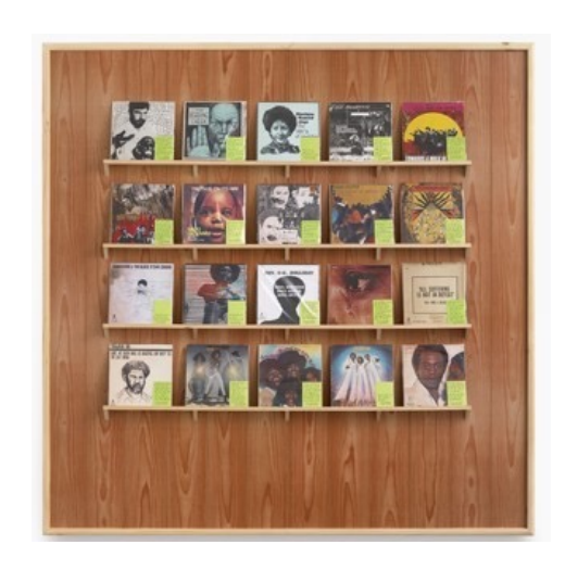
Pride Record findings—Tokyo, 2005–16 Mixed media on album cover, wood paneling, wood shelving, plastic bags Courtesy the artist