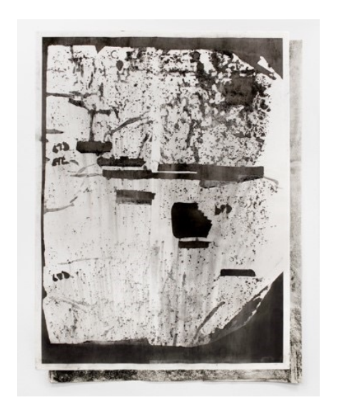
Moon Eats Sun, 2010 Graphite powder on paper Courtesy the artist and Inman Gallery, Houston

In the 2008 work X Codex , Cyrus reproduces and enlarges the envelope and cover page of the FBI's surveillance file on Malcolm X by laying a stencil over thick paper and roughly sweeping graphite into the substrate with a broom. The process turns drawing into an action marrying labor and performance, as Cyrus paradoxically reverses the metaphor of sweeping something away to instead remember something. Although we cannot read or know the information that once was contained in these files, these works nonetheless live as imperfect recordings. Cyrus later used the same technique at the Audubon Ballroom in East Harlem (where X was assassinated in 1965) to produce swept rubbings or reproductions of related documents in Moon Eats Sun. Its title refers to a solar eclipse, a rare but sublime occasion when the moon overtakes the sun. As a metaphor, the work speaks to the moment when those on the margins overtake the center, opening the possibility for reappraisal, rereading, and renewal.