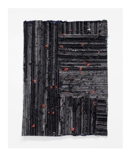
Vertical Procession (before the Second Line), 2019 Black denim, vinyl records, and cotton thread Collection of Marlene Marker, Houston

Departing from appropriating redacted documents, as he does in Cultr_Ops series (also on view in this exhibition), here Cyrus uses torn strips of denim to imagine a contemporary form of ecstasy long associated in art history with religious experiences. Euphoria and pain, typically opposing emotions, are represented in Ecstatic Blues Shape and Vertical Procession (before the Second Line) , respectively.