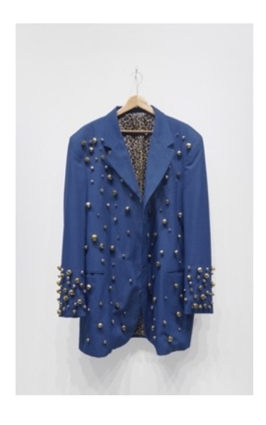
Bright Blue, 2018 Blazer, bells, satin Courtesy the artist and Inman Gallery, Houston