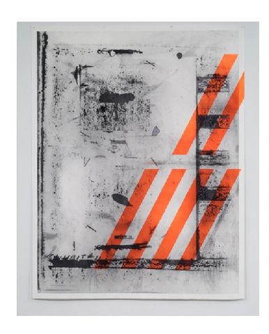
We'll Wait for You, 2010 Graphite and paint on paper

The optimistically titled We'll Wait for You taps into the hope for heroic Black voices in history to be reappraised and recognized. Additionally, Cyrus adds a speculative dimension, employing previously classified FBI files on UFOs and connecting references and affinities for aliens and interplanetary travel in twentieth-century Black music, from the mothership in Parliament Funkadelic to Sun Ra's supposed birth on Saturn and cosmic musings, retroactively described as "Afrofuturist." However, the theory that aliens may have also built the pyramids in Egypt is far more contested, alluding to historical, racist suggestions that Africans could not have constructed something so lasting and complex. By aligning the ongoing plight of African Americans with the enslaved Children of Israel, Cyrus proposes a transatlantic version of what critic Merla Watson calls an "alternative genealogy" that "account[s] for myriad parallels among global cultures"