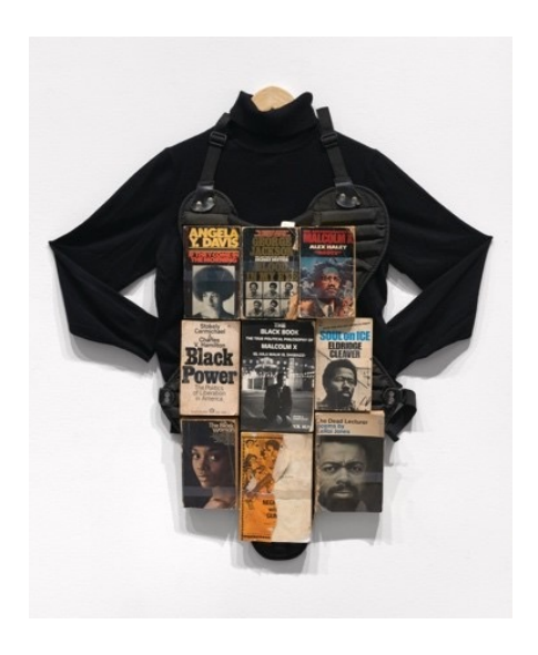
Africanismus_12469, 2006 Found padded vest, paperback books, cotton shirt

In Africanismus 12469, Cyrus fortifies a padded black vest with a tiled "shield" of paperback books by progressive Black authors, such as Angela Y. Davis, Alex Haley, and LeRoi Jones (Amiri Baraka), referencing a common practice by incarcerated people in which protective vests are fashioned from phonebooks to lessen the impact of punches, knives, and other assaults. In the work's title, Cyrus memorializes the assassination of Fred Hampton (1948–1969), activist and chairman of the Illinois chapter of the Black Panther Party (BPP), by Chicago Police on December 4, 1969. The charismatic Hampton, also deputy chairman of the national BPP, was a revolutionary socialist who founded the antiracist, multicultural Rainbow Coalition alongside members of the Young Lords and the Young Patriots Organization in April 1969. In 1970, the local County Coroner inquest into his death concluded that Hampton's death was "justifiable homicide"; a 1982 civil lawsuit awarded $1.85 million to survivors and relatives of Hampton and fellow Panther Mark Clark who had died in the same raid