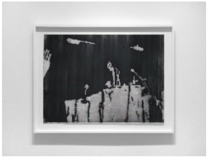
The Black Messiah, Live at the Troubadour, 2008 Copy toner on paper Private collection

Tracing the lineage of both the trumpet and its accompanying "mutes" back to West Africa, Cyrus creates a diasporic trio of tribal instruments that spans the Atlantic Ocean. Cyrus cites the virtuosic trumpet playing and crossover musical success of Louis Armstrong (1901–1971) in the work's title via the three-letter identifier for New Orleans International Airport, now named after the iconic musician. The conch reflects the music of the Middle Passage, while the earthenware jug symbolizes West Africa, and the root ball embodies the American South. The bronzed conch shell acts as a precursor of the trumpet and evokes its historical employment in political uprisings such as the 1791 rebellion of enslaved peoples in Haiti. Muffles or "mutes" are used to alter the sound of the trumpet; Cyrus invites the viewer to imagine how the root ball and earthenware vessel would mimic a mute's effect, whether literally in a contemporary concert or figuratively in political consciousness. In 2018, Cyrus took a transformative forty-five-day journey across four continents, seven countries and twelve cities connected by the transatlantic slave trade; MSY draws parallels between the way mutes alter the path of sound similarly to the way migration and travel transform our ways of thinking.