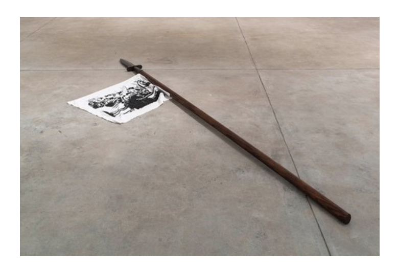
On Floor: Major & Minor , 2014 Wood, steel, fabric, silk screen, and tacks Everson Museum of Art, Syracuse; Museum purchase, Deaccession Fund, 2021.6