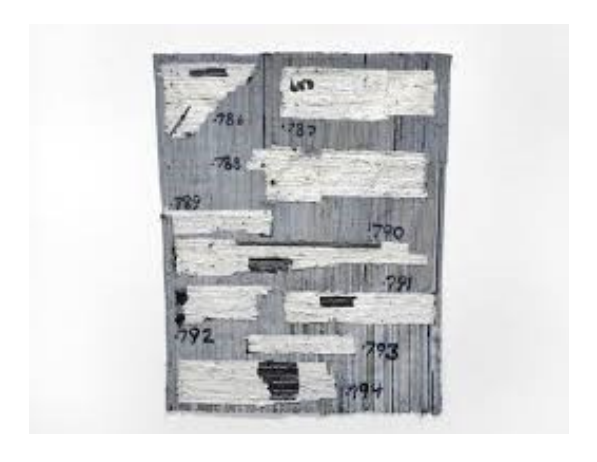
Notes from the Pharoah's Den, 2020 Blue denim, bleached denim, cotton thread Collection of Gregory and Alyssa Shannon

Throughout the twentieth century, several Black public figures experienced ongoing state surveillance and intimidation. This resulted in decades-worth of covert operations and classified materials, which Cyrus excavates in his use of redacted FBI documents as source material. By removing all extant text from these partial archives and remaking them in materials ranging from graphite and wax to cotton and denim, he transforms trauma and erasure into generative abstractions. Cyrus's decision to work almost exclusively in denim for these pieces speaks to the ambivalent legacy of this textile as workingclass, historically associated with enslaved African Americans. By tearing it into strips and reassembling the denim into a collage, Cyrus also pays homage to the Gee's Bend quilters from Alabama, as well as the Asante tradition of making kente cloth in Ghana. Many of these references come together in Beneath the Obelisk II and Notes from the Pharaoh's Den.