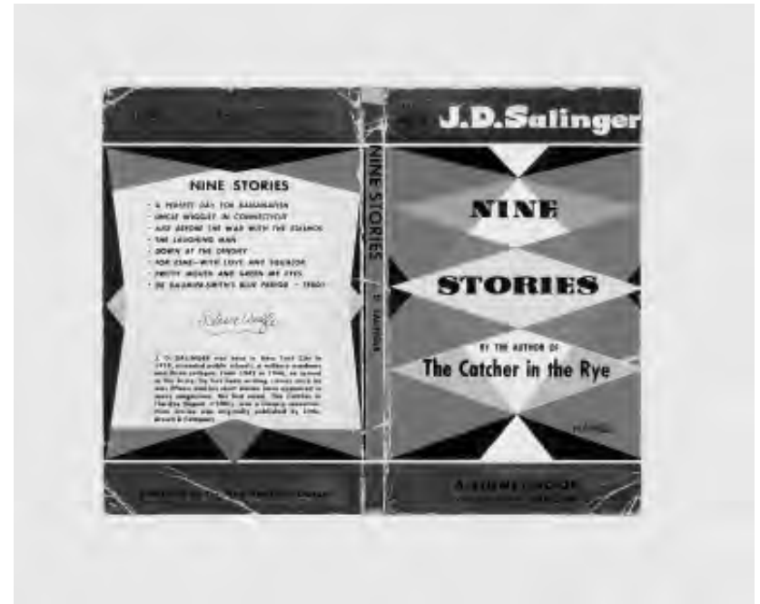
Untitled (Study for Nine Stories ), 1992. Oil, screenprint, lithography, and modeling paste on board; image: 7 x 8¾ inches, sheet: 12 x 13¾ inches. Collection of Daniel Weinberg.

Although books are mass-produced, Wolfe portrays individual books. Describing one piece, he said: “I began . . . a Penguin paperback of Anna Karenina that I had read on the beach during the summer. The illustration . . . [was] very complex with lots of images. The book itself was puffed up to twice its normal