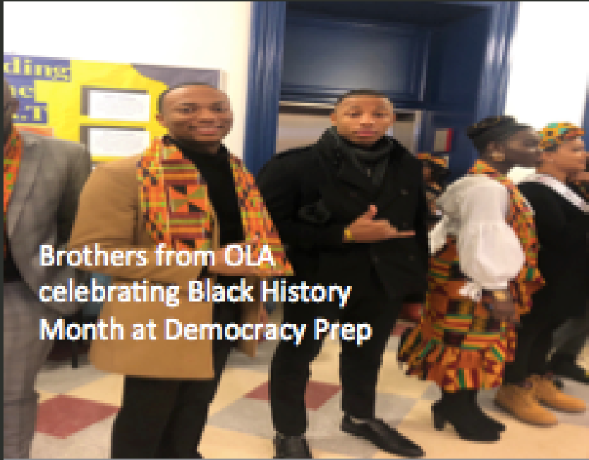
Brothers from OLA celebrating Black History Month at Democracy Prep