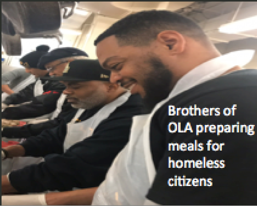
Brothers of OLA preparing meals for homeless citizens