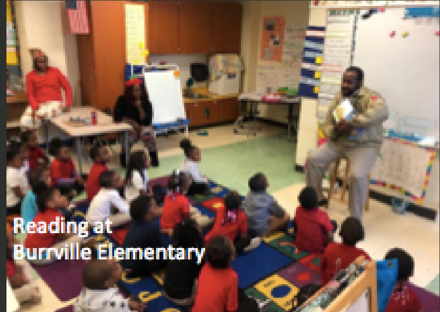
Reading at Burrville Elementary