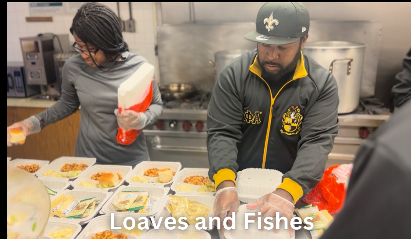
Loaves and Fishes