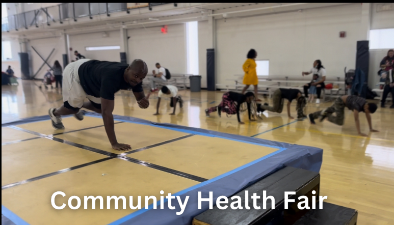
Community Health Fair