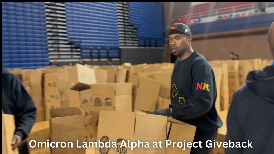
Omicron Lambda Alpha at Project Giveback