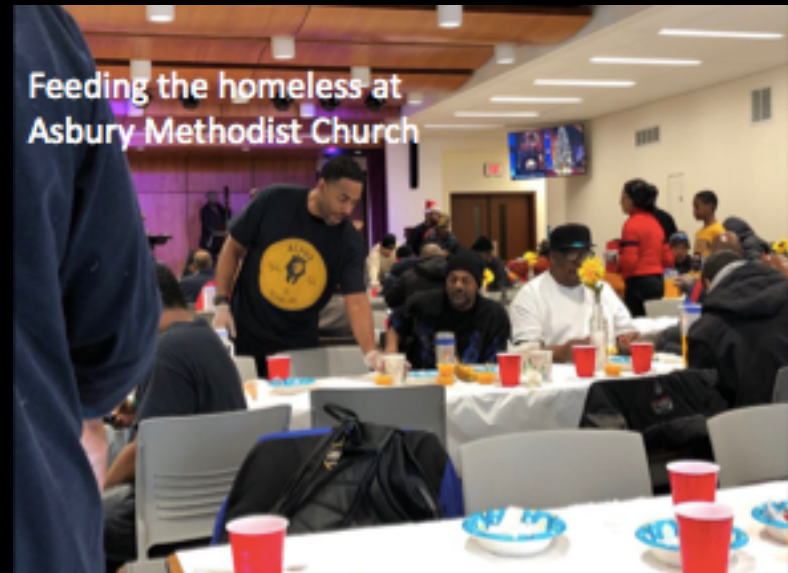
Feeding the homeless at Asbury Methodist Church