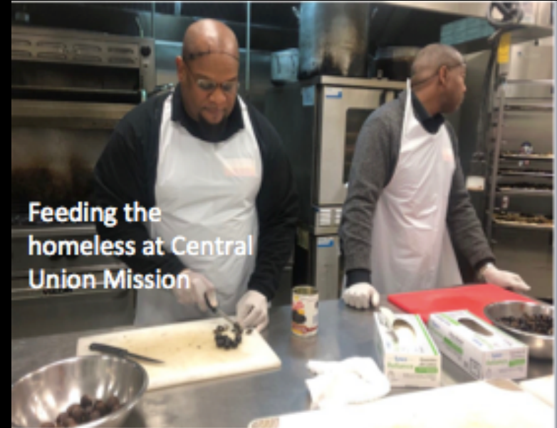
Feeding the homeless at Central Union Mission