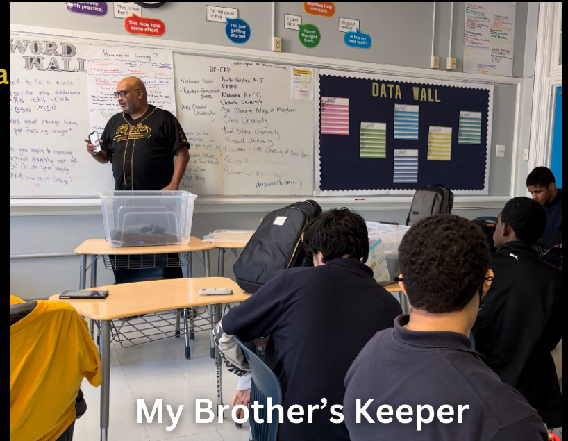
My Brother's Keeper

OLA has multiple community service programs each month to uplift those in need.