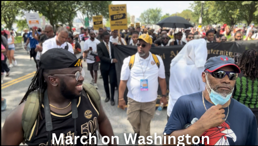
March on Washington