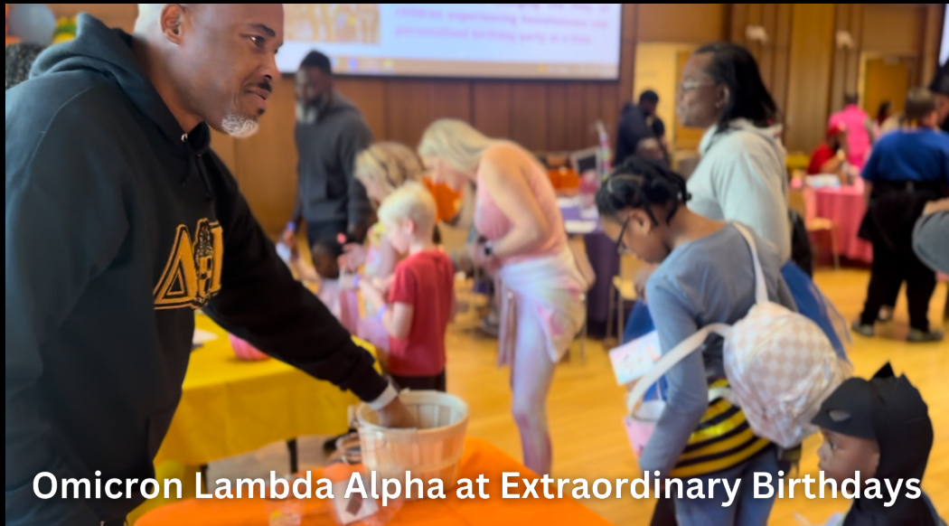
Omicron Lambda Alpha at Extraordinary Birthdays