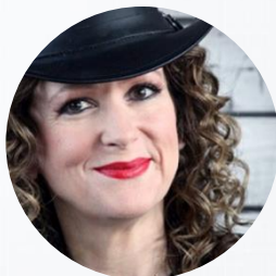
Laurell K Hamilton