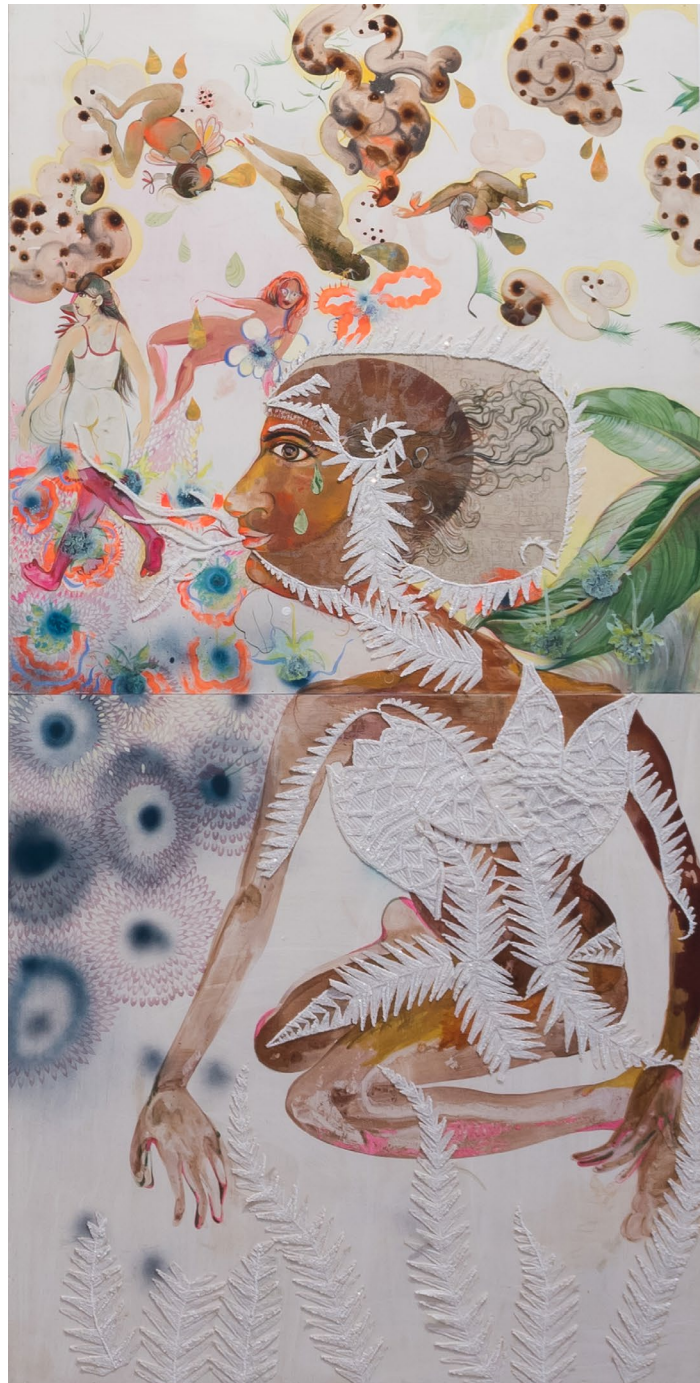
Rina Banerjee, Mother gathered Three and no more dirty stones, tossed them to sky that could break what had hardened her ground and without frown or flirt of flower father like grease or butter slipped aside to free from forty and some more grown men who held her as housewife like plant life with Three or no more daughters , 2017, Acrylic and collage on wood panel, 79 x 39 inches

Featuring artist Rina Banerjee from the Tang exhibition Never Done: 100 Years of Women in Politics and Beyond