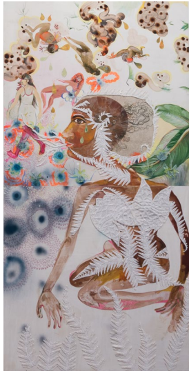
Rina Banerjee, 2017