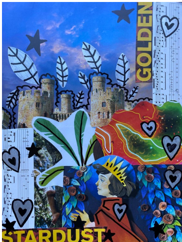
Artwork by Cassie Bond '21

Suggested Materials: Paper, pencils, markers, paints, newspapers, magazines, found images and fabrics, glue stick—use what you have available!