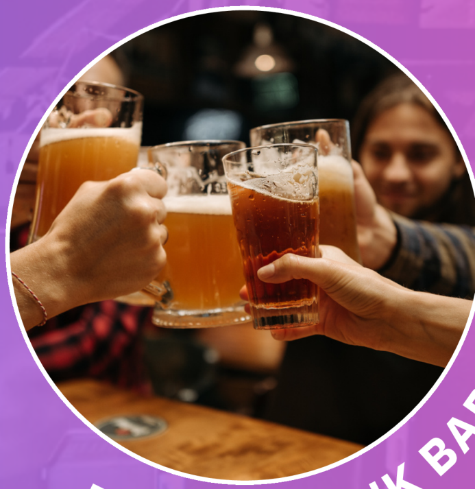
BEER & DRINK BAR