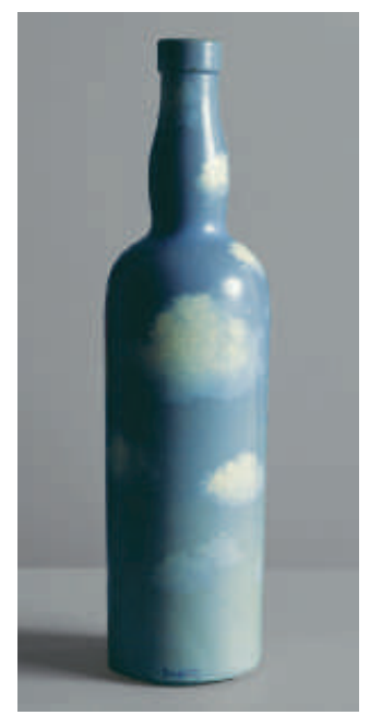
René Magritte, La Courbure de l'univers ( The Curvature of the Universe ), 1950. Oil on glass bottle, 11<sup>1</sup>/<sub>2</sub> x 3<sup>1</sup>/<sub>8</sub> inches (29 x 7.9 x 7.9 cm). The Menil Collection, Houston.

Magritte often used gouache when revisiting and reinterpreting themes from earlier paintings, creating variations on his already established imagery, as with the 1957 version of La Trahison des images ( Treachery of Images ). It is a postcard-size near-replica of his 1929 masterpiece. No doubt the artist understood and exploited the marketability of these smaller versions of his most popular pictures, but Magritte, who delighted in undermining such lofty concepts as authenticity and originality, may also have enjoyed the irony of handcrafting miniature reproductions of his own work.