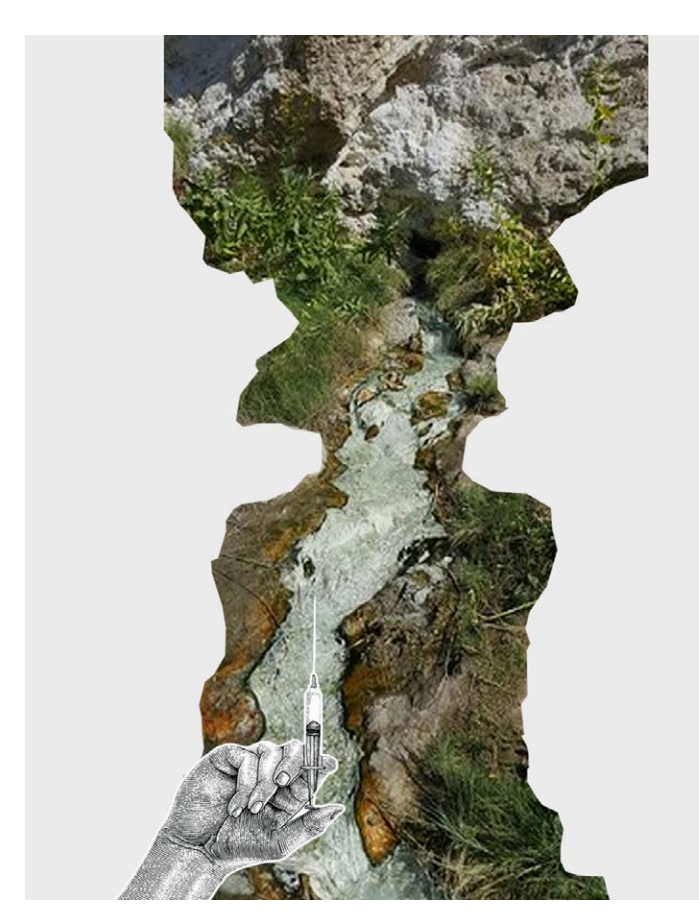
Figure 2: Medical Tourism Collage done by Joyce Zhou

The Architect had built the hotel out of stone, a material commonly used in the home country and other colonial territories at the time. Due to its sturdy nature, it withstood earthquakes, hurricanes for centuries. The design of the hotel had stone corridors, with wide verandahs that would allow for the cool breeze to enter the interior rooms with lofty vaulted ceilings, allowing spacious rooms to feel airy. The verandahs frame the views of the sea, the town, and the whole length of St. Kitts, allowing the visitor to have unobstructed views of the luscious greenery that the island has to offer. The hotel continued to be a popular destination for tourists