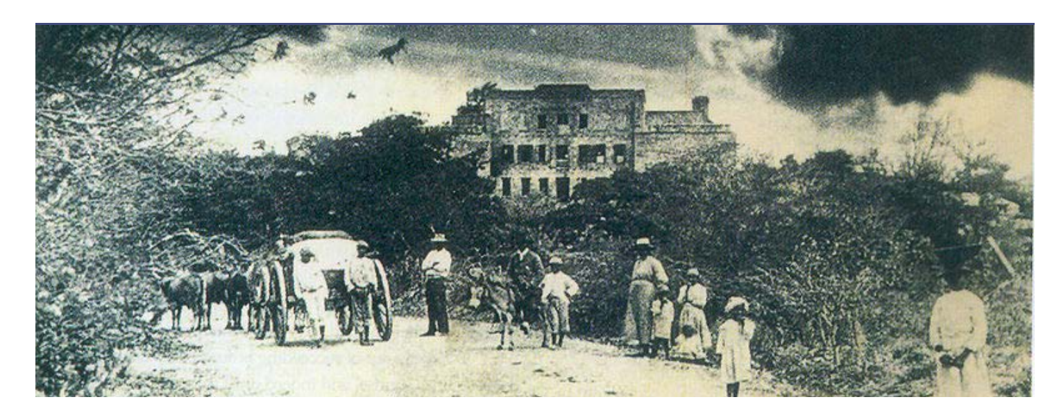
Figure 1: Bath Hotel, Nevis.

There is a long history of travelling to foreign countries in order to receive healthcare, a number of countries around the world position themselves in order to attract visitors for specific specialisations that the region is often known for. Oftentimes these countries are able to offer more accessible, less expensive and a more luxurious experience. Several Caribbean nations, such as Cuba, Barbados, Jamaica and Puerto Rico have been a part of this growing form of tourism.