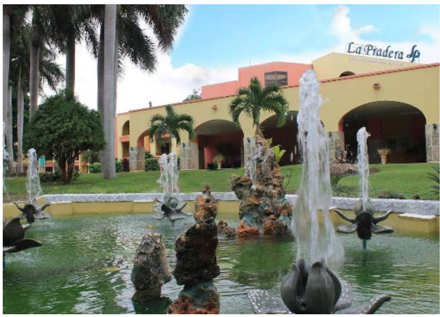
Figure 3. Photo showing the back of La Pradera, a health care centre, La Pradera. 1857.

websites will have a photo gallery of white sandy beaches and sunsets, alongside classrooms and laboratories in order to convey and situate the 'caribbean aesthetic' in a healthcare setting. <sup>14</sup>As the American University of Antigua College of Medicine put it: "Location is surprisingly a lot more important than you think. When you're studying medicine in Connecticut, you're probably not thinking about brutal winters or having to dig your car out of the snow. At a Caribbean medical school, you'll be studying in a tropical paradise and that means no worries about crazy weather fluctuations. Seriously, winter is the worst." Incredibly, in addition to creating the image of a tropical paradise the school continues to then sell the typical amenities that are targeted towards tourists by highlighting the proximity the school was to touristic amenities and attractions.