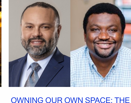
EXPERIENCES OF MINORITY DEVELOPERS November 12, 12pm Virtual

Maritime Building, a massive historic cast iron and steel structure. Organized as part of the Preservation Lecture Series.