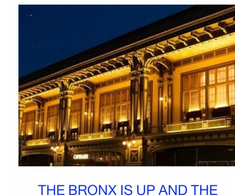
BATTERY'S DOWN November 11, 6:30pm Avery 115