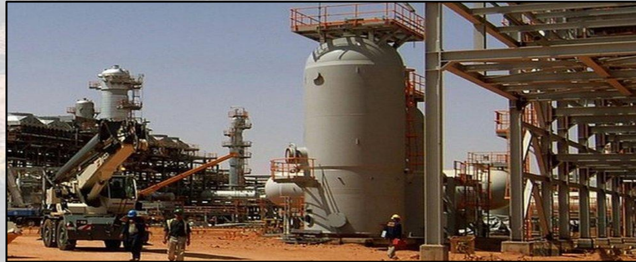
Algeria: January 16, 2013 Al-Qaeda terrorist attack against the In Amenas gas plant.