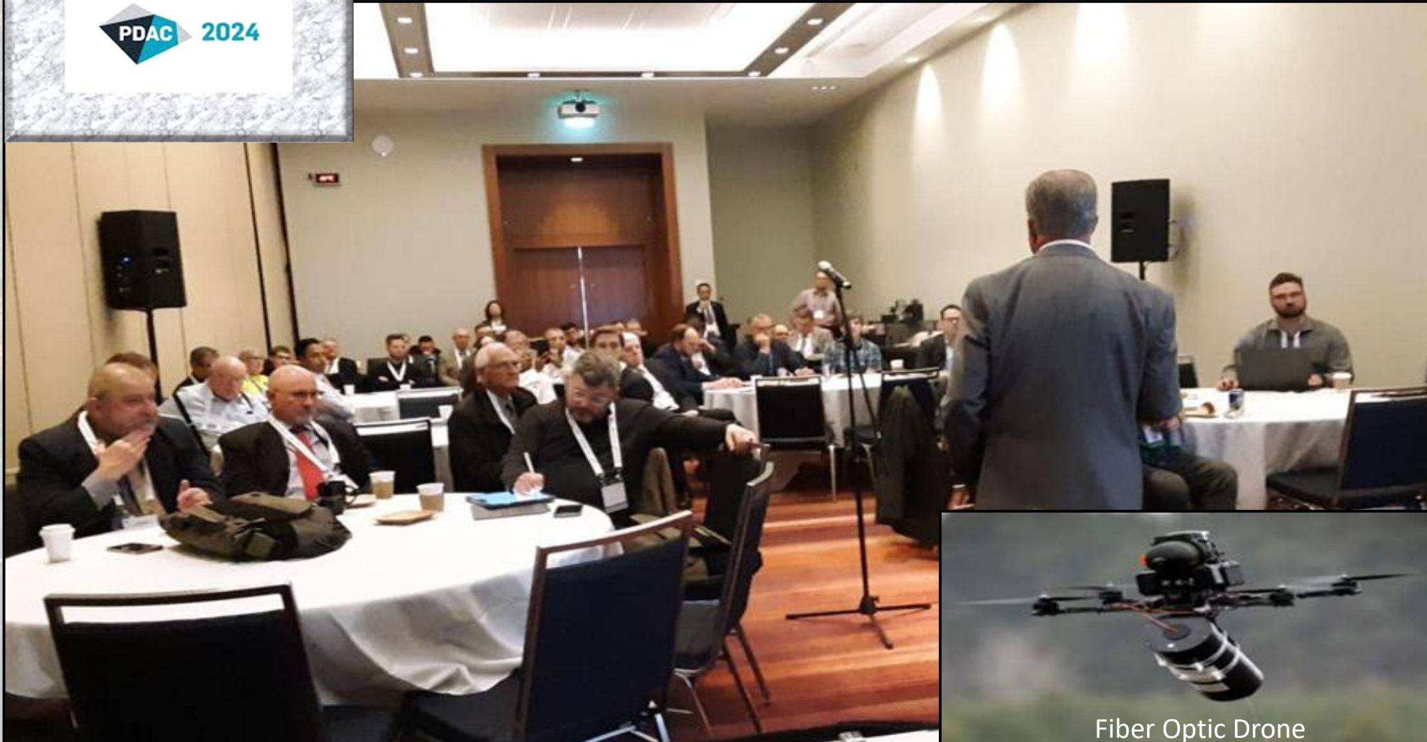
Fiber Optic Drone