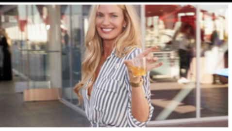
Luxury Experience & Co Kicked Off The Ultimate Athlete & Celebrity Gifting Lounge Experience