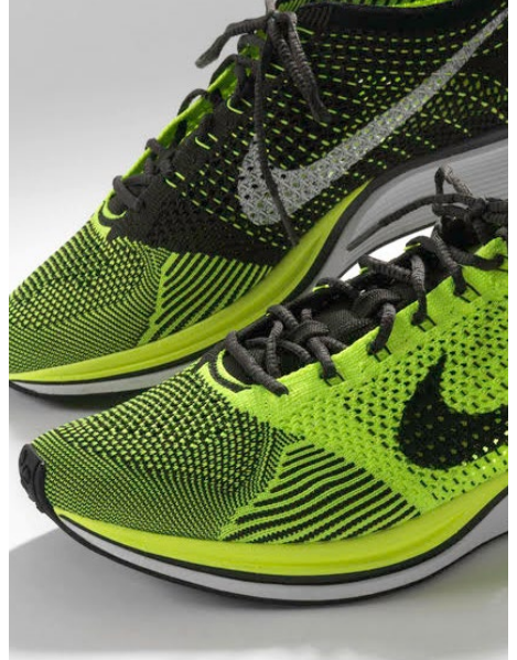
Cooper Hewitt Museum