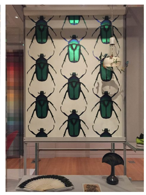
Cooper Hewitt Exhibition