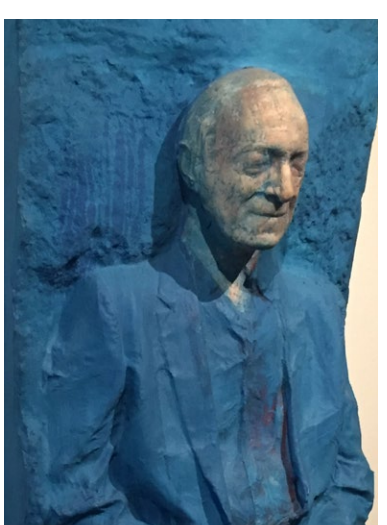
The Met Breuer