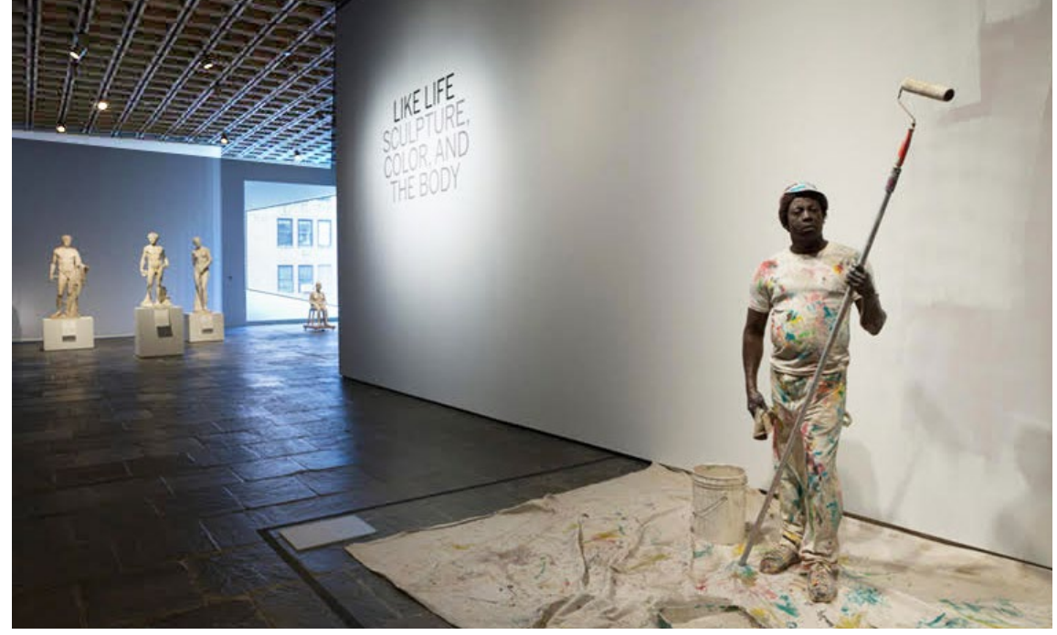
Met Breuer Exhibition