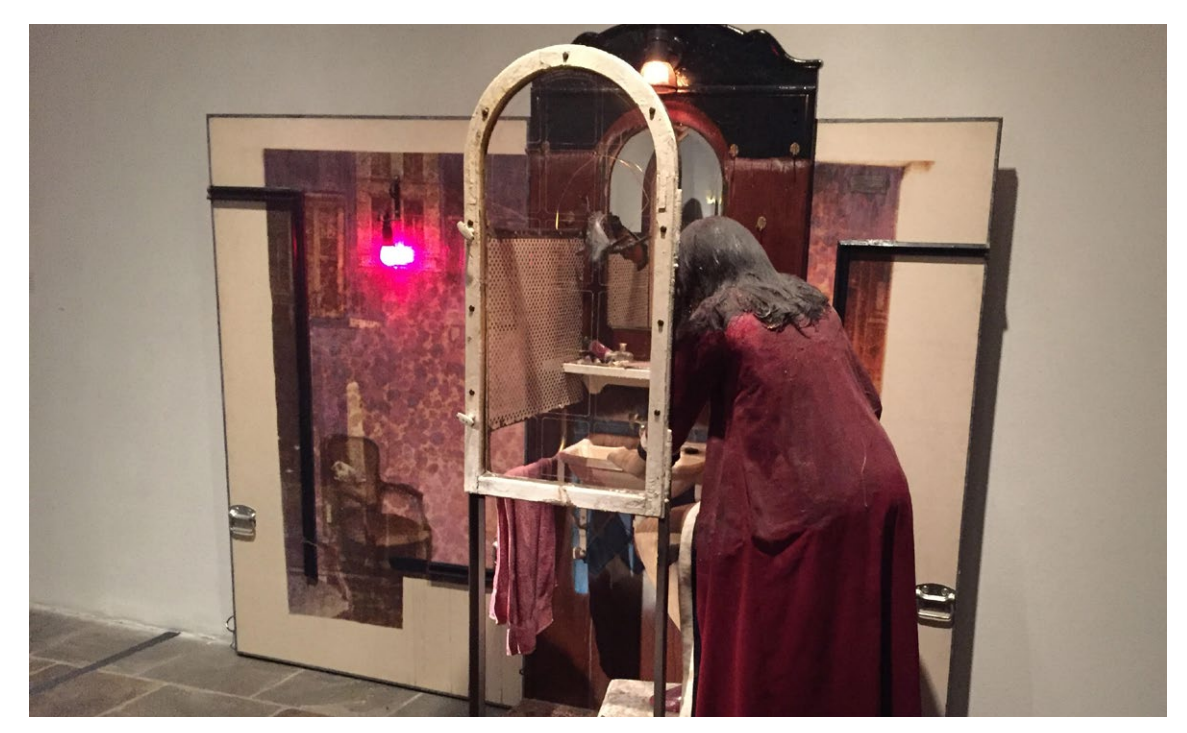
Met Breuer Exhibition