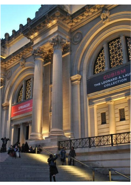
Metropolitan Museum of Art