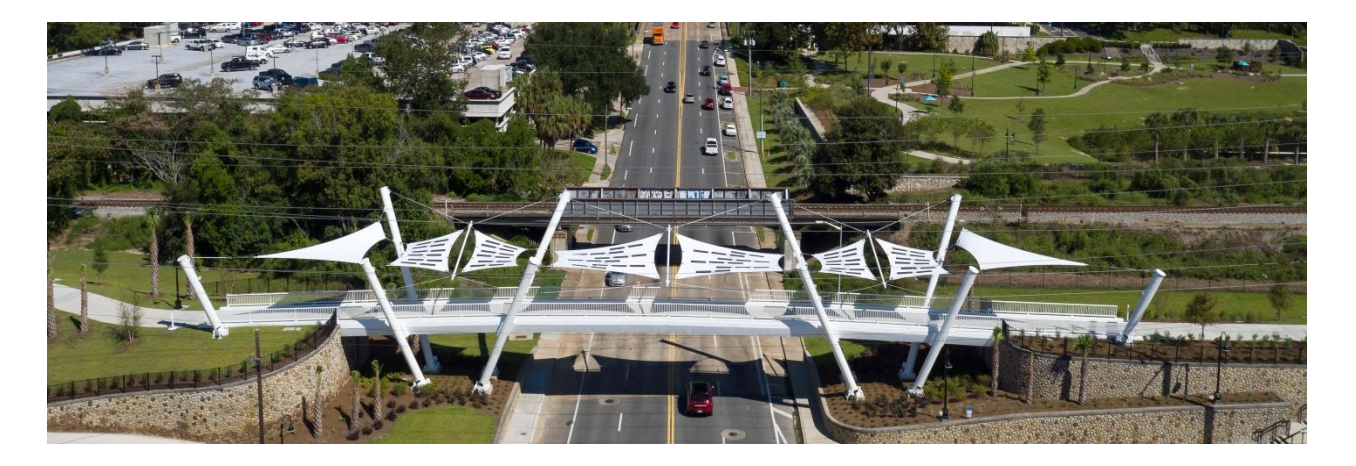
Capital Cascades Bridge, Tallahassee, FL. designed by Figg Bridge Group. Photovoltaic membrane design, engineering, testing and fabrication, by Pvilion.