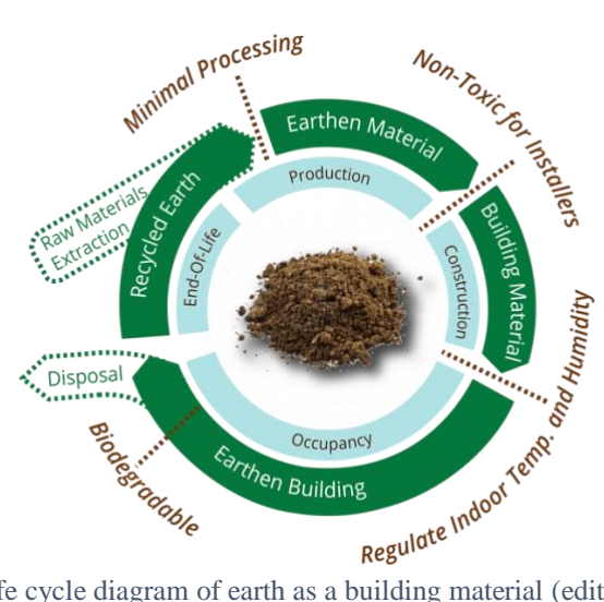
Figure 1: Cradle to cradle life cycle diagram of earth as a building material (edited from Schroeder, 2016)

earthen walls (cob, rammed earth, and light straw clay) and 3 conventional walls (timber frame, insulated and uninsulated concrete block). The functional unit used is 1 square meter of a single-family housing wall, located in warm-hot climates in the US, defined as IECC climate zones 1 through 4 [49]. The system boundaries consider embodied environmental impacts, including the extraction and processing of raw materials, manufacturing, storage, and transporting to the construction site.