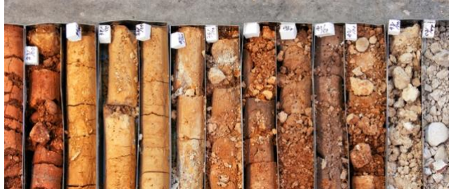
Figure 3: Homogenized soil classification, assessed in accordance with Australian Standard [63]

The challenge of material variation could be addressed by various strategies. By using wood as an example for a natural building material with large variability, we can identify the ways in which we developed both prescriptive and performance standards for timber. While the number of wood species is great, the main strategy used in timber standardization is to group species according to their structural properties and appearances, prescribing uniform grade-use data for each group. Similar to timber codes and standards, a homogenization approach grouping different species or 'classes' of clay materials should be developed for earthen materials to ensure adherence with format and objectives of conventional standards.