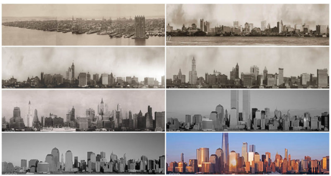
New York City Changing Skyline, The Skyscraper Museum.