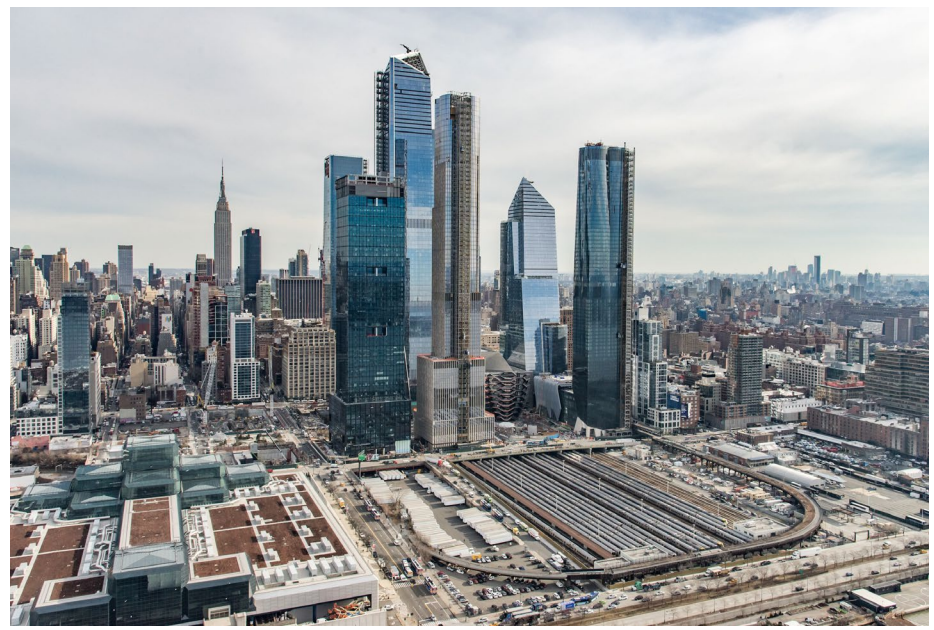
Aerial View of Hudson Yards, New York

Our side will be – of course – Hudson Yards, New York's newest something. It's kind of a neighborhood, kind of a shopping mall, kind of a collection of very odd skyscrapers. They are planning a phase two and we will be showing them how to do it right!