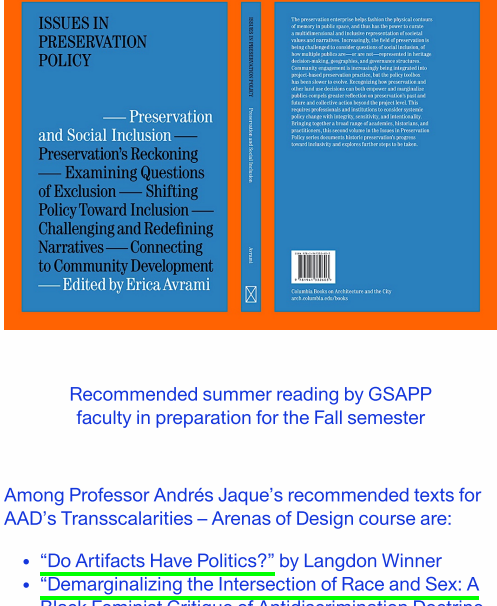
Work by Luiza Furia '20 MARCH completed during the Fall 2019 Transitional Geometries course led by Faculty Joshua Jordan.

The following faculty workshops and lectures are open to all GSAPP students.