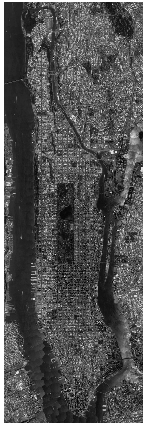
Figure 5: The island of Manhattan will be our lab. We will both engage and propose alternatives to the cityscape, all while simultaneously being sensitive to, and critical of, the existing state of the city. Change is the only constant in New York City.

In addition, throughout the semester particular attention will be given to representation and presentation skills. You will be required to develop a visual language that supports your project thesis, and to implement it at each pin-up and review. Drawing and models are the primary mode of communication for architects, and the studio will put emphasis on both throughout the semester. Presentation skills will also be developed and discussed. Dry-run presentations before each major review will allow for individual feedback and dialogue about presenting your work, as well as framing your argument through your drawings.