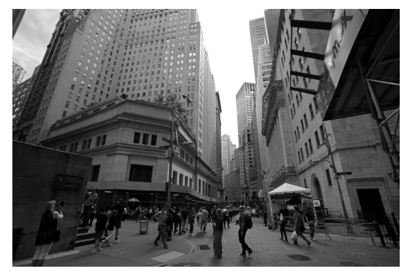
Figure 2: Financial District, Manhattan. Irregular street pattern from the original Dutch settlement and pedestrian-only.