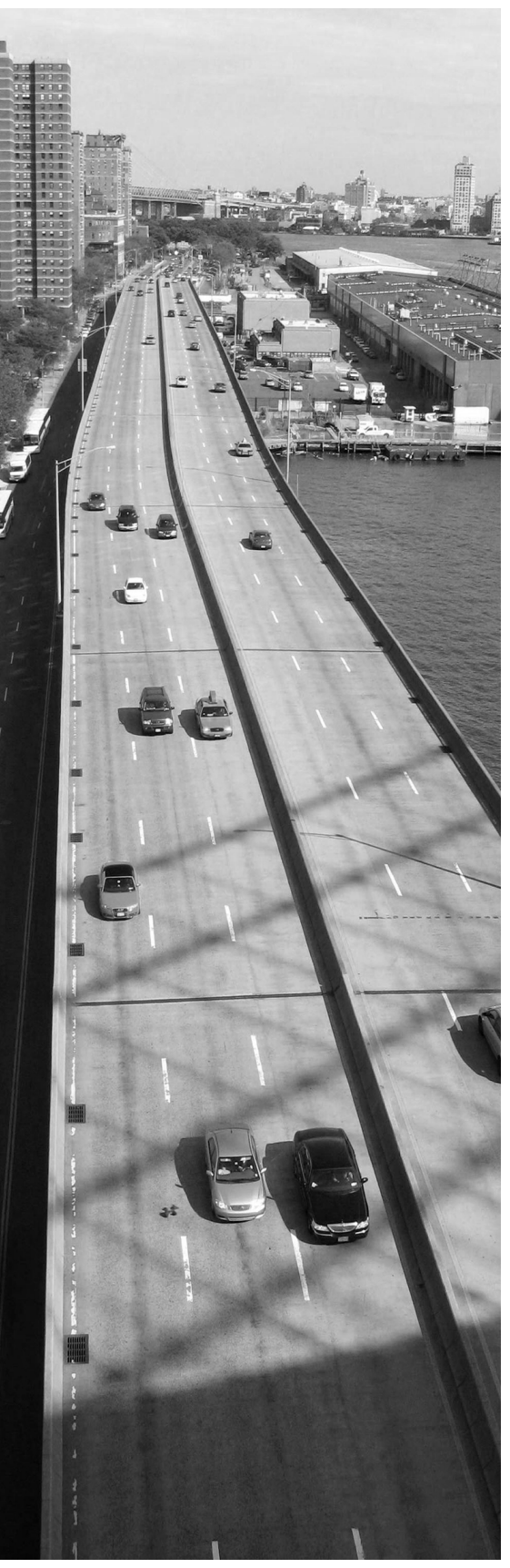
Figure 6: We will consider the relationship between the city and its waterfront. Currently, Battery Park is the only place on the island where you can access the waterfront without engaging a freeway.

Moss, Stephen. "End of the Car Age: How Cities Are Outgrowing the Automobile." The Guardian , April 28, 2015. Accessed December 1, 2016. https://www.theguardian.com/cities/2015/apr/28/end-of-the-car-age-how-cities-outgrew-the-automobile.