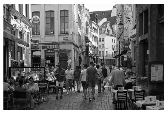
Figure 1: Brussels, Belgium. An example of a medieval street, planned around the human scale and without vehicular traffic.

Along with the rise of vehicular traffic on our streets, the vehicles themselves needed a place to reside when not in use. In the urban context, vehicular parking has become a major part of the planning puzzle. Nearly every street in New York City gives at least one lane of traffic over to stationary vehicles, and most of these give two. Add to this the need for a new building typology (the parking garage) to handle the overflow of stationary vehicles, and one can easily see the impact that vehicles have had on the spatial experience of our cities.