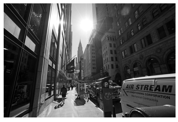
Figure 3: Midtown Manhattan. Vehicular traffic is given precendence, with foot traffic pushed up against building facades.