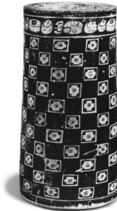
Vessel Mayan, 400–900 AD Painted terracotta 10 \frac{3}{8} x 5 \frac{5}{8} x 5 \frac{5}{8} inches The Menil Collection, Houston

While these objects reduce the gap between believers and divine forces, others function as reminders of the great distance between the two. A pair of late thirteenth-century Flemish or Rhenish figures from a group of ecclesiastical sculptures would have been placed in an architectural setting. Whether elevated in a wall niche or placed on par with the viewer, the sculptures' large scale—particularly as an ensemble—would force the viewer to stand back, reinforcing the idea that the believer must commit to his or her religious practice in order to achieve greater proximity. This concept is modeled by the ensemble itself, which, in its complete form, would portray the crucifixion of Christ with faithful disciples and saints to his left and right—positions only achieved through lives